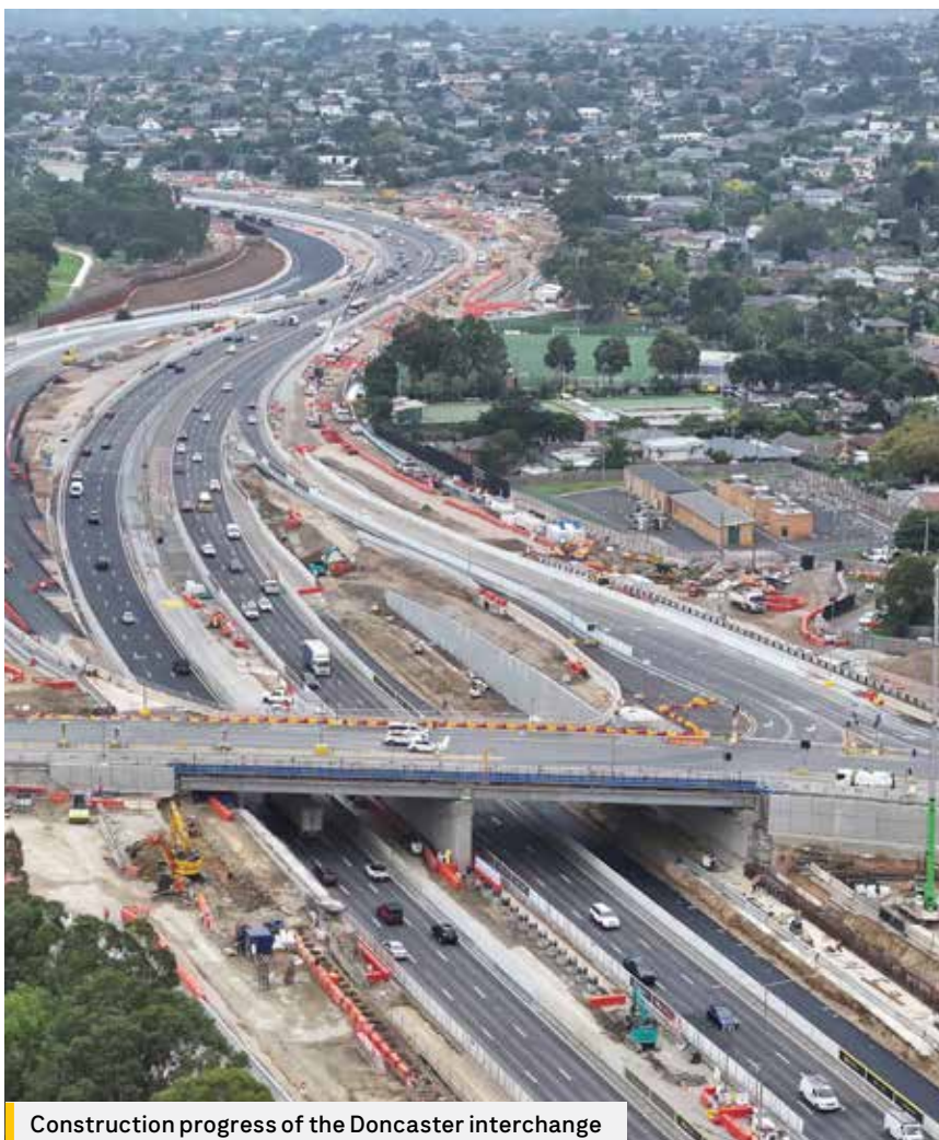
Construction progress of the Doncaster interchange