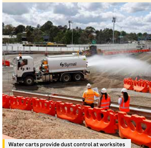
Water carts provide dust control at worksites