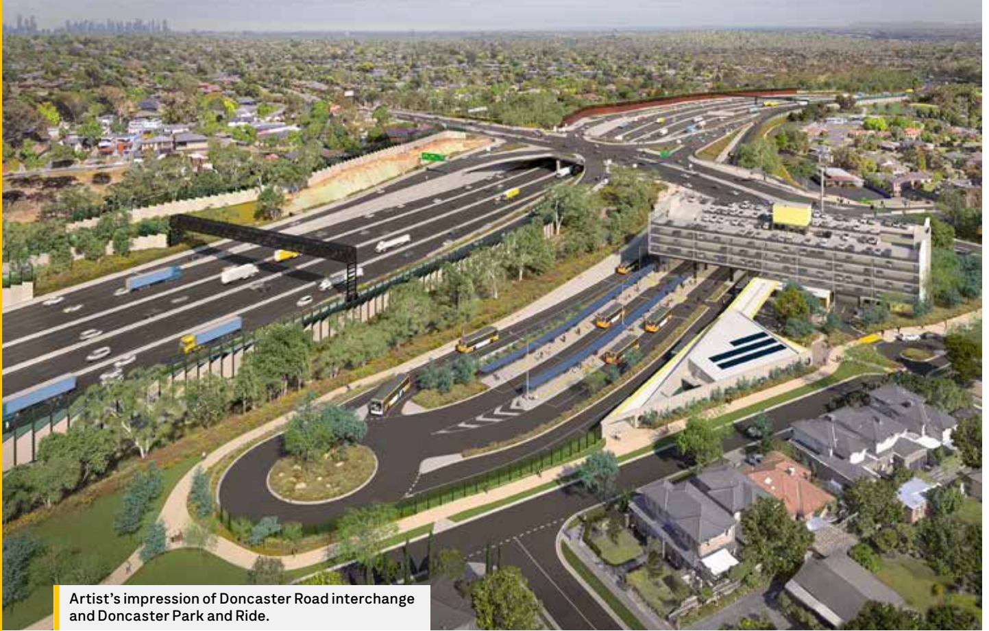
Artist's impression of Doncaster Road interchange and Doncaster Park and Ride.