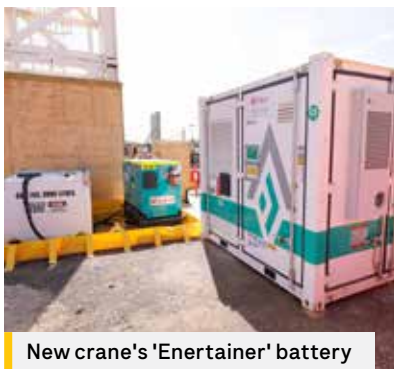
New crane's 'Enerainer' battery

From a sustainability point of view, it's a big win!