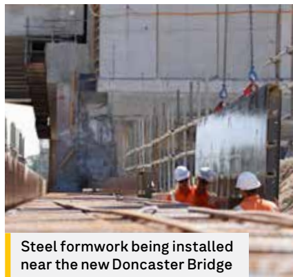
Steel formwork being installed near the new Doncaster Bridge

The new Doncaster Road bridge will be wider to accommodate 10 lanes of traffic and higher to allow for the new Eastern Busway connecting Bulleen and Doncaster park and rides.