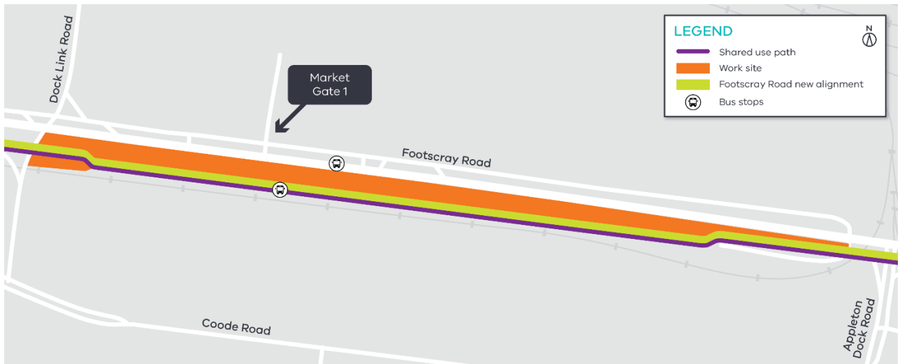
Figure 2: Footscray Road traffic alignment