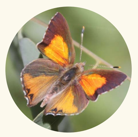
Eltham Copper Butterfly

Can you spot the ants in the illustration on the next page?