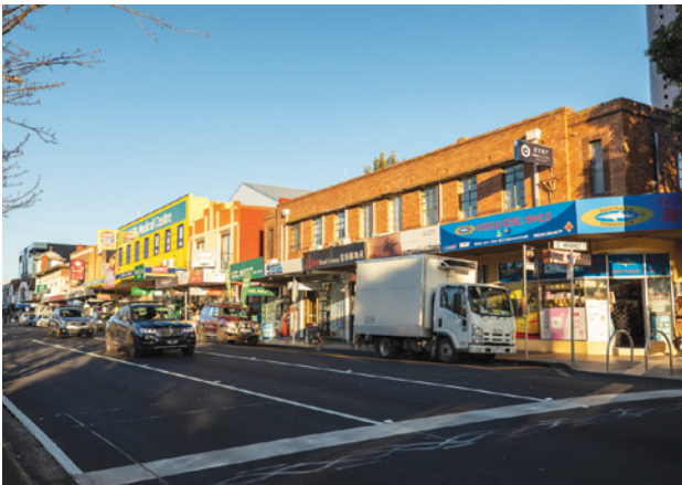
Whitehorse Road shopping strip, Box Hill

Suburban Rail Loop Authority will continue to work with Traditional Owners to explore opportunities to embed Indigenous knowledge and values into station precinct planning, architecture and built form, landscape design, interpretation and wayfinding, visual art and language.