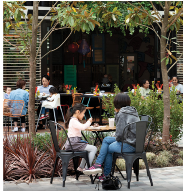
The Glen Shopping Centre, Glen Waverley

There is also the potential for temporary effects on local amenity due to access changes or noise and dust, which could affect local businesses. Changes to residential amenity resulting from construction activities would be addressed through EPRs.