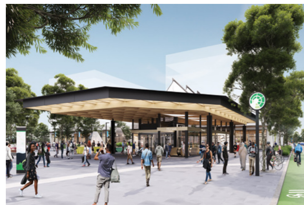
Concept image of the new SRL East station at Monash

SRL East will create new jobs and trigger more activities around the six station precincts, bringing new opportunities for people to work, study, shop and socialise closer to where they live.