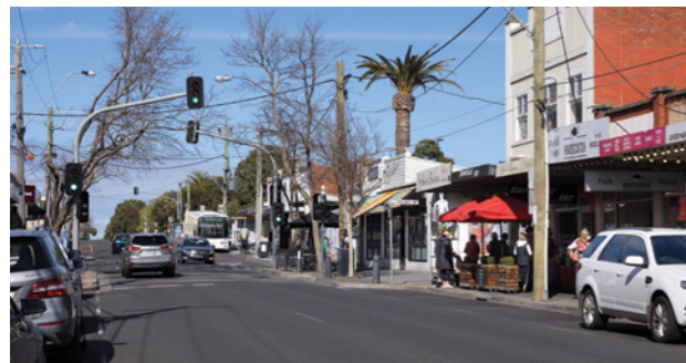
Charman Road shopping strip, Cheltenham

A dedicated landowner and business support team will continue to work closely with local businesses to understand their individual circumstances and how the project can best support them.