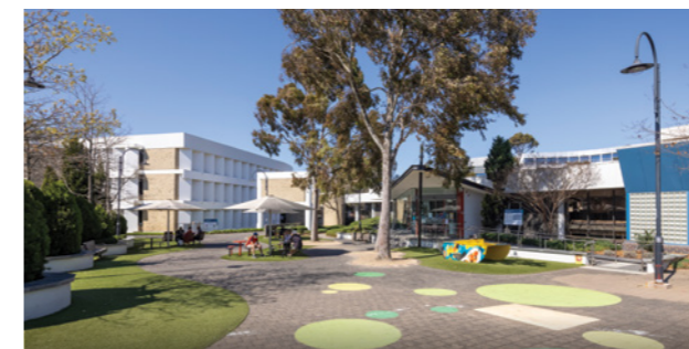
Glen Waverley Library, Glen Waverley

The Urban Design Strategy will deliver quality and integrated design that enhances the liveability of SRL East precincts and helps to transform the way Victorians live, work and travel.