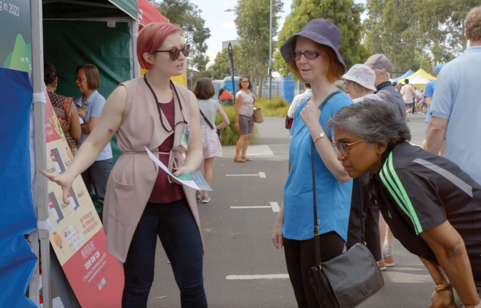
Kingston Farmers Market, Cheltenham