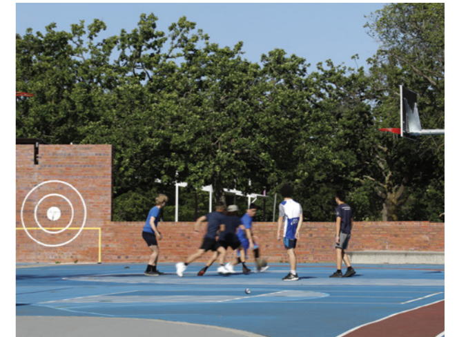
Box Hill Gardens, Box Hill