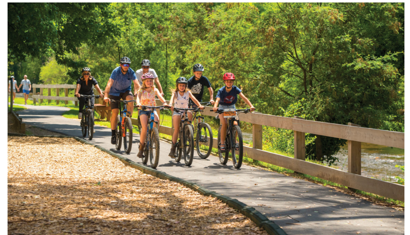
Gardiners Creek, Burwood