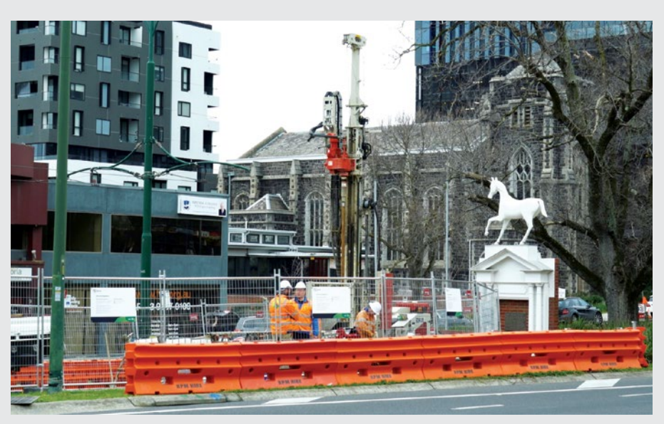
Geotechnical drilling in Box Hill

These on-the-ground activities, along with expert technical assessments, help to inform our planning and design work and Investment Case.