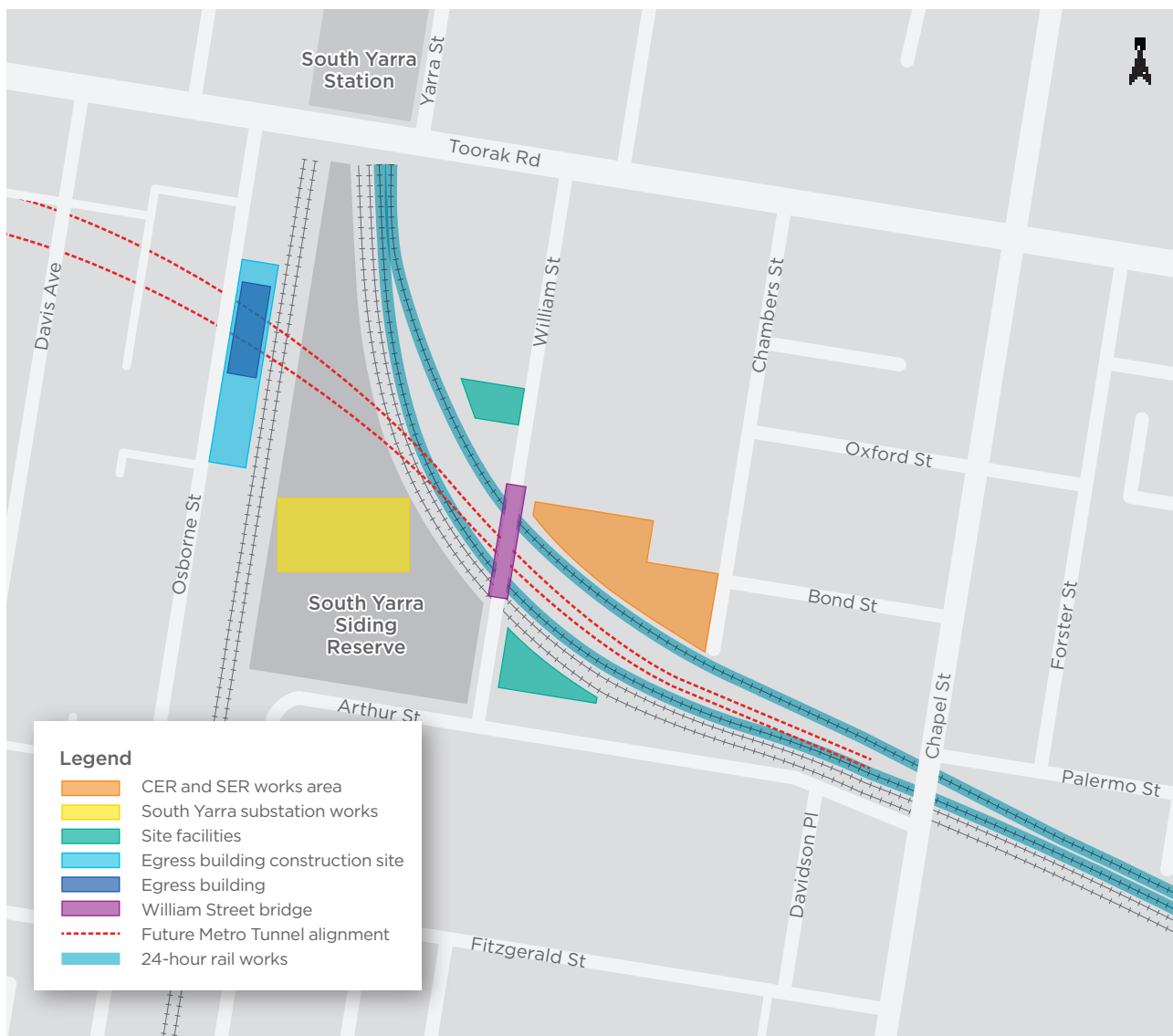
South Yarra construction works - Indicative only