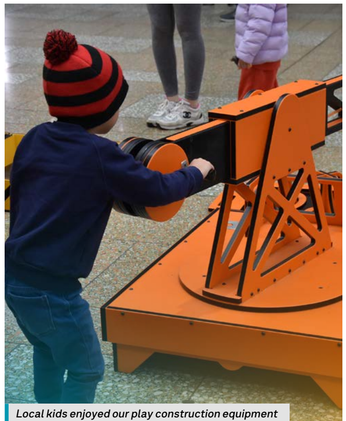
Local kids enjoyed our play construction equipment