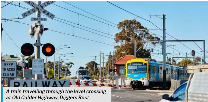
A train travelling through the level crossing at Old Calder Highway, Diggers Rest

Learn more about the project and be the first to know about project news by visiting levelcrossings.vic.gov.au/diggers-rest