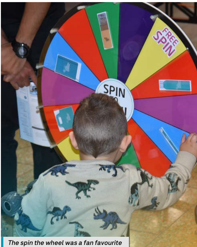
The spin the wheel was a fan favourite