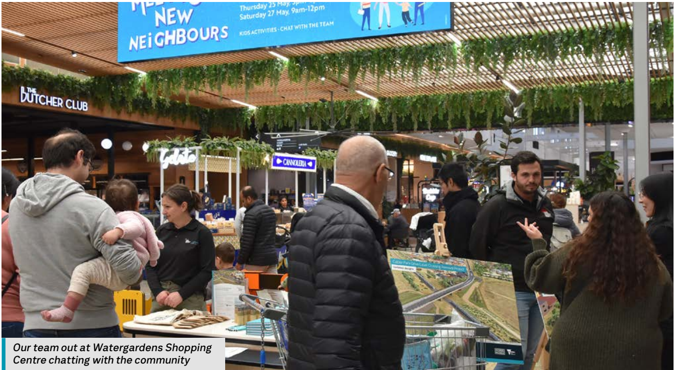
Our team out at Watergardens Shopping Centre chatting with the community

Our team will continue to work with the community to keep you informed as works progress through a range of channels, including letterbox drops, door knocks and email updates.