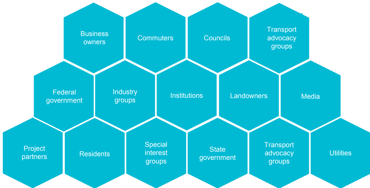
Figure 7-2 Categories of stakeholder

Extensive targeted engagement has also been undertaken with a number of key stakeholder groups. These groups are described in the following sections.