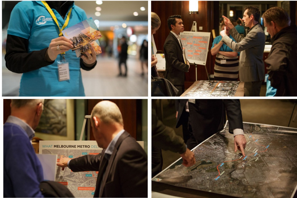
Figure 7-3 Engagement activities