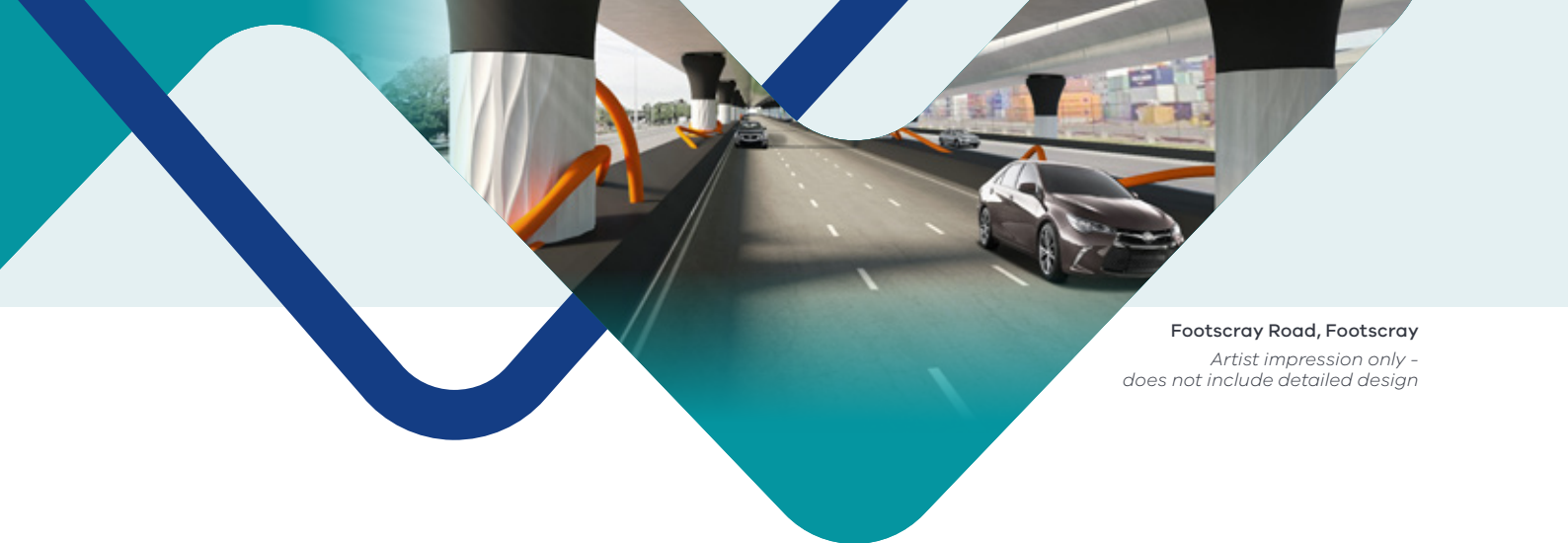
Footscray Road, Footscray Artist impression only - does not include detailed design