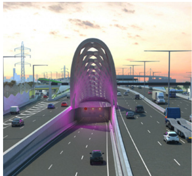
Above: Inbound tunnel portal Pictured at top: Maribyrnong river crossing Artist impressions only - does not include detailed design

The EES is now being publicly exhibited and open for submissions, until 5pm, Monday 10 July 2017.