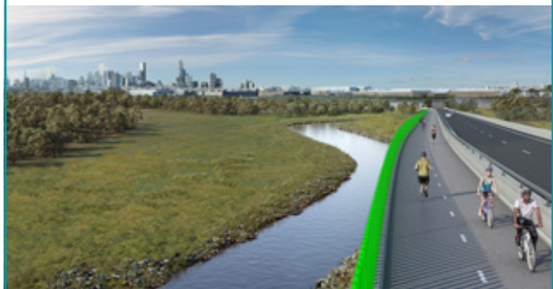
New shared use path alongside the Hyde Street off ramp Artist impression only - does not include detailed design