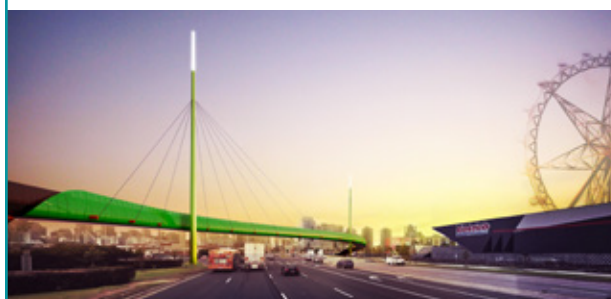
Footscray Road pedestrian bridge

We will communicate any activities to nearby residents in advance and ensure information is available on our website.