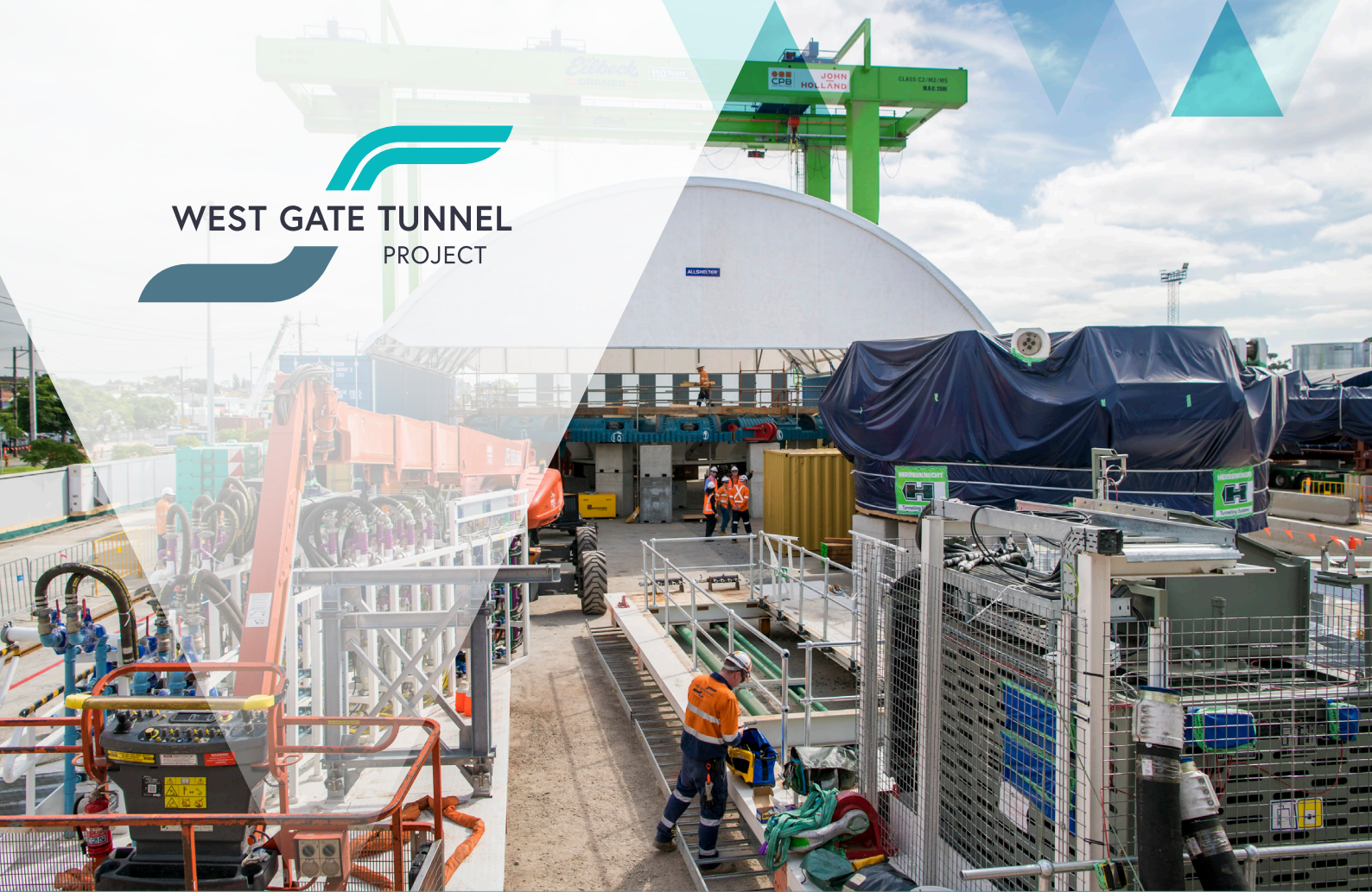
TBM Bella being built at the northern portal.