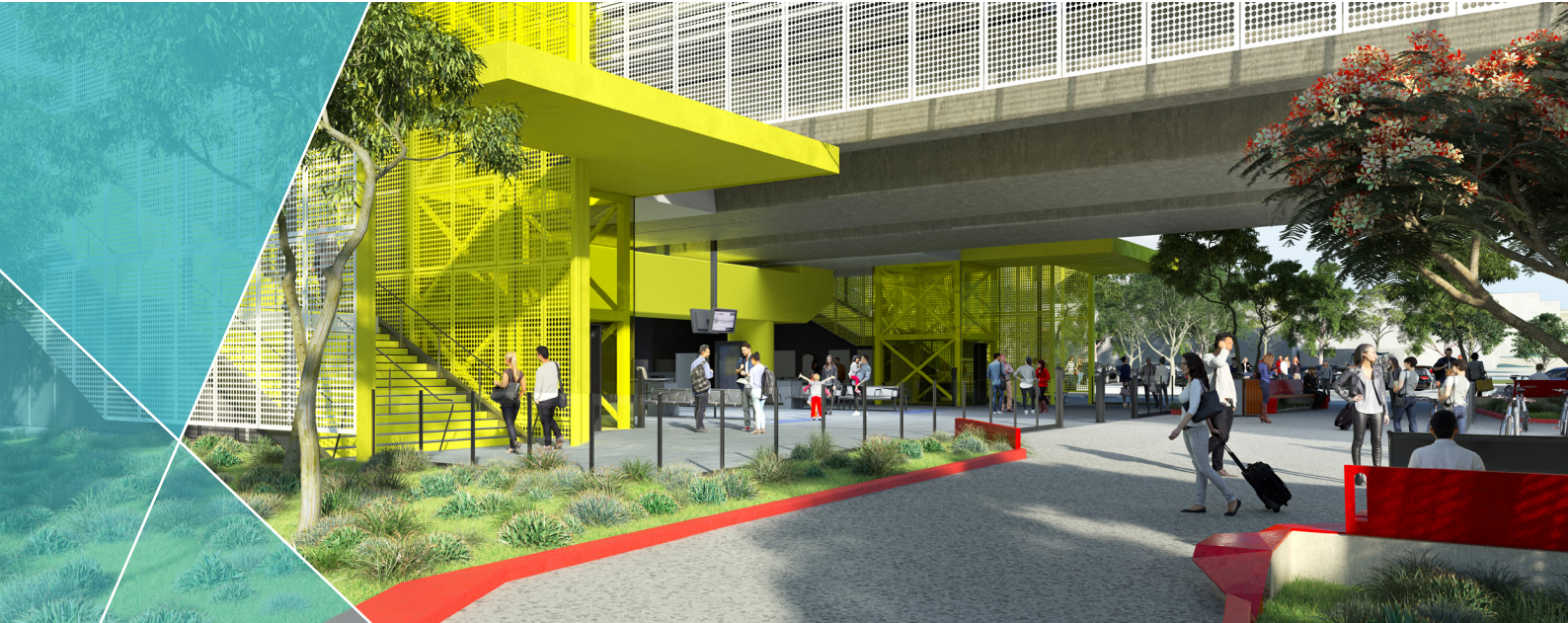
Hallam Station west entrance

The Victorian Government is removing the dangerous level crossing at Hallam Road, Hallam, and building a new station to improve safety, reduce congestion and pave the way for more trains, more often on the Pakenham Line.