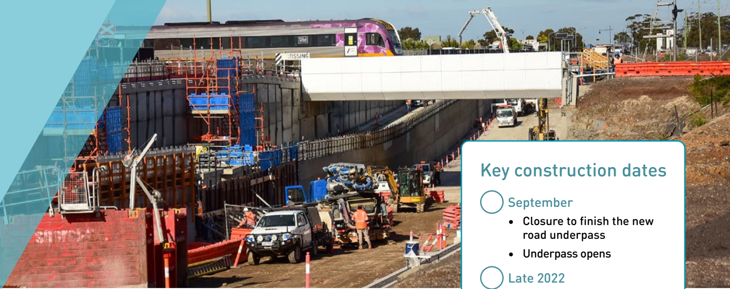
Excavating the new Robynson Road underpass