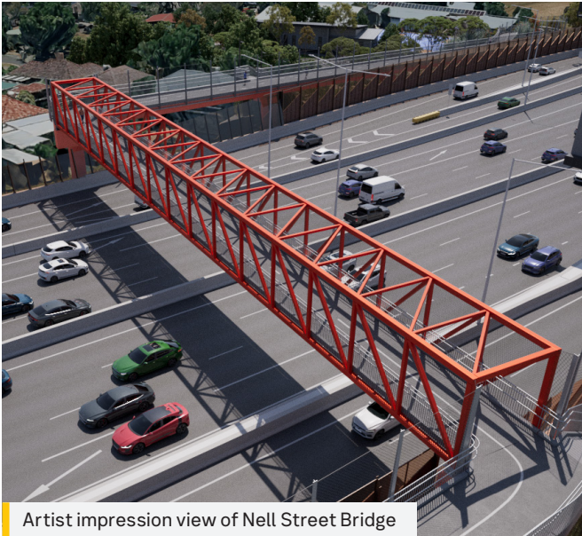
Artist impression view of Nell Street Bridge

The new Nell Street bridge will be located just a 2-minute walk away from the old bridge, improving connectivity and clearing the way for extra lanes and express access to the North East Link tunnels.