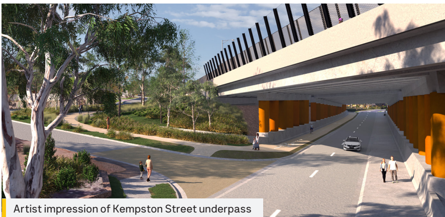
Artist impression of Kempston Street underpass