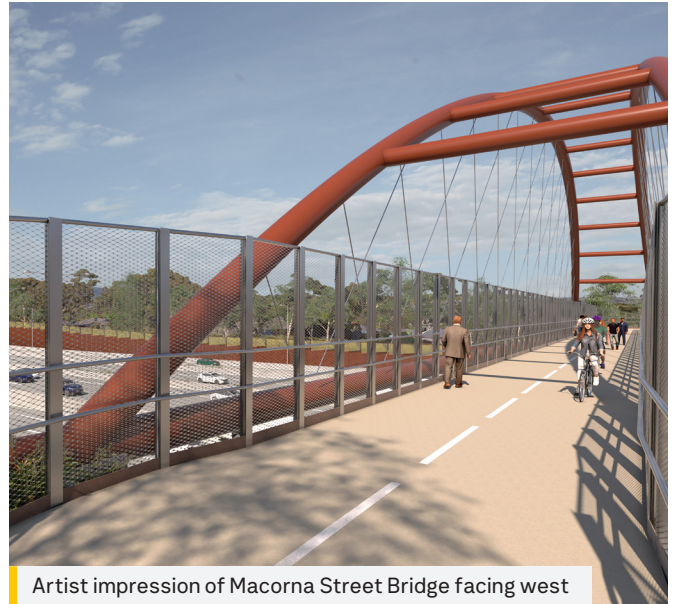
Artist impression of Macorna Street Bridge facing west