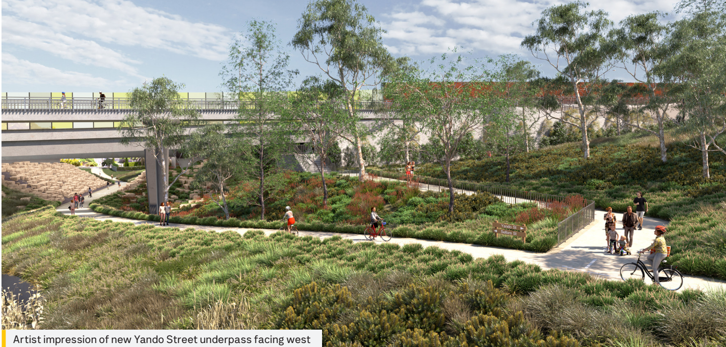
Artist impression of new Yando Street underpass facing west