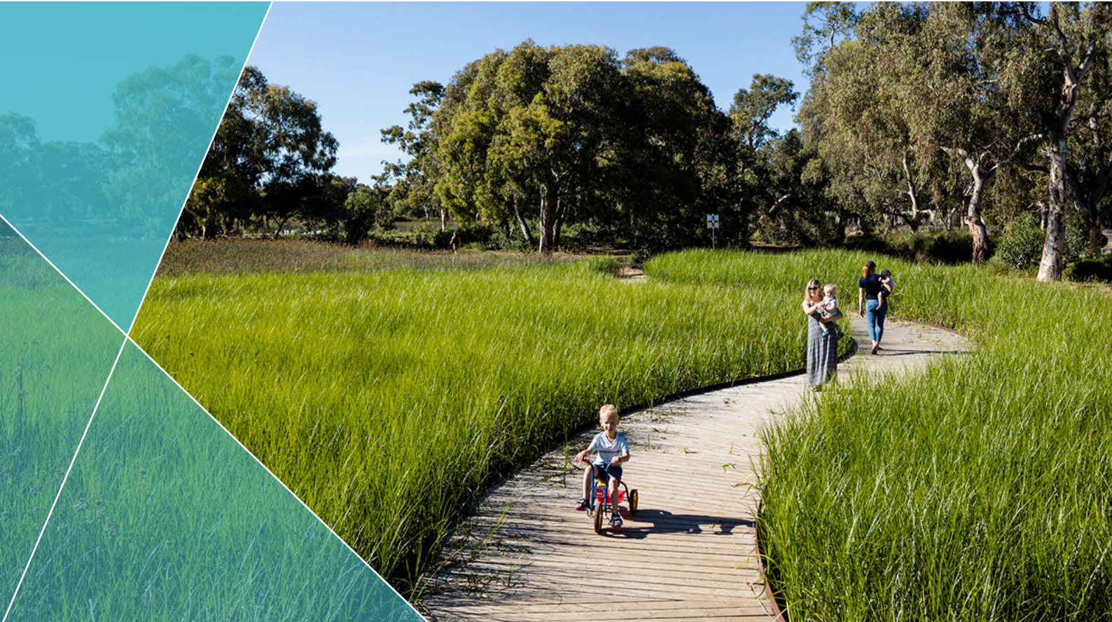
Artist's impression only, subject to change.

The Victorian Government is removing the dangerous and congested level crossings at Oakover Road, Bell Street, Cramer Street, and Murray Road, Preston.