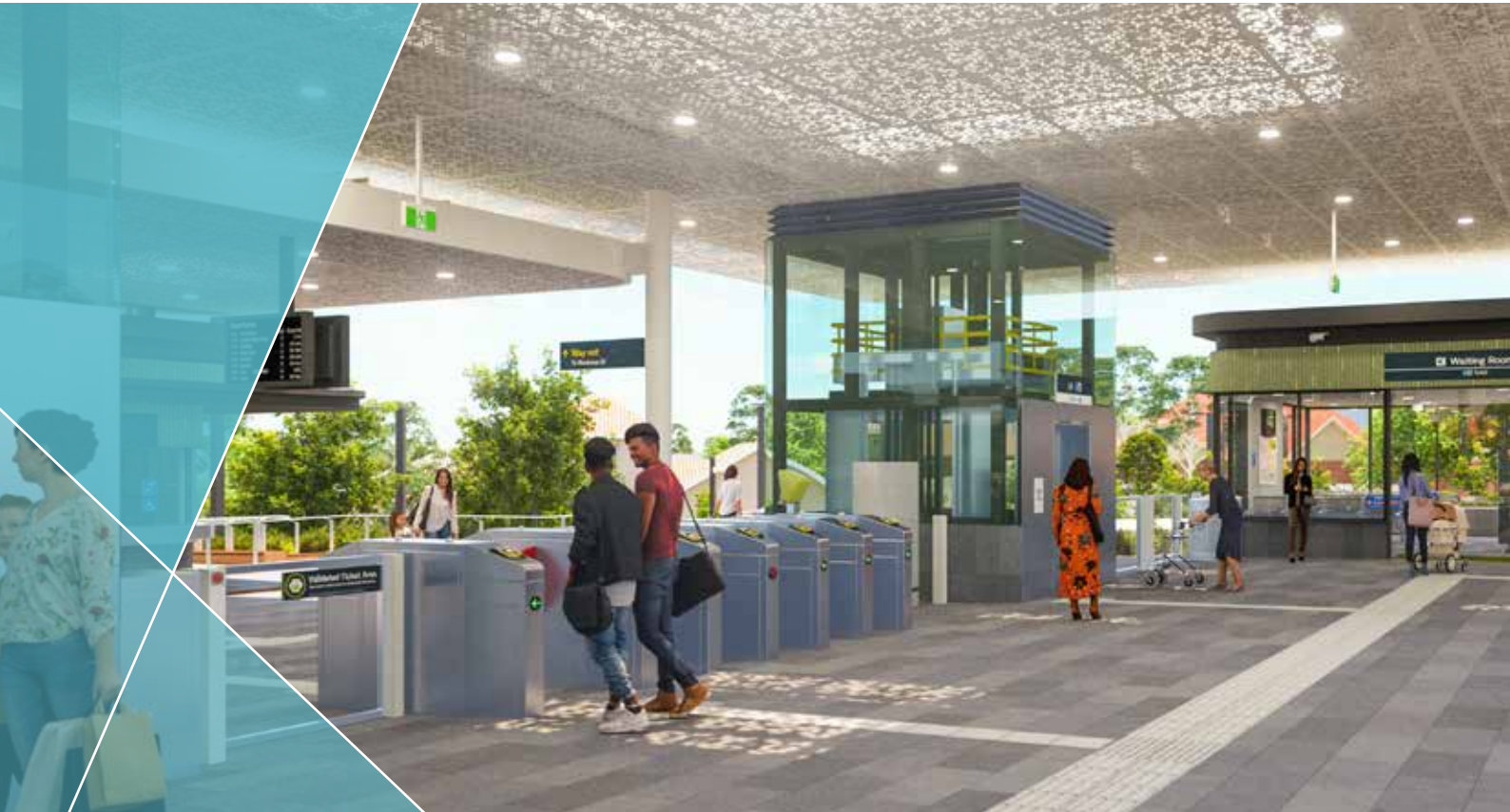
Union Station main concourse with canopy that creates a dappled light effect. Artist impression only, subject to change.

Major works are well underway to remove the dangerous and congested level crossings at Union Road, Surrey Hills and Mont Albert Road, Mont Albert and build the new Union Station. The boom gates will be gone and the new station open in 2023.