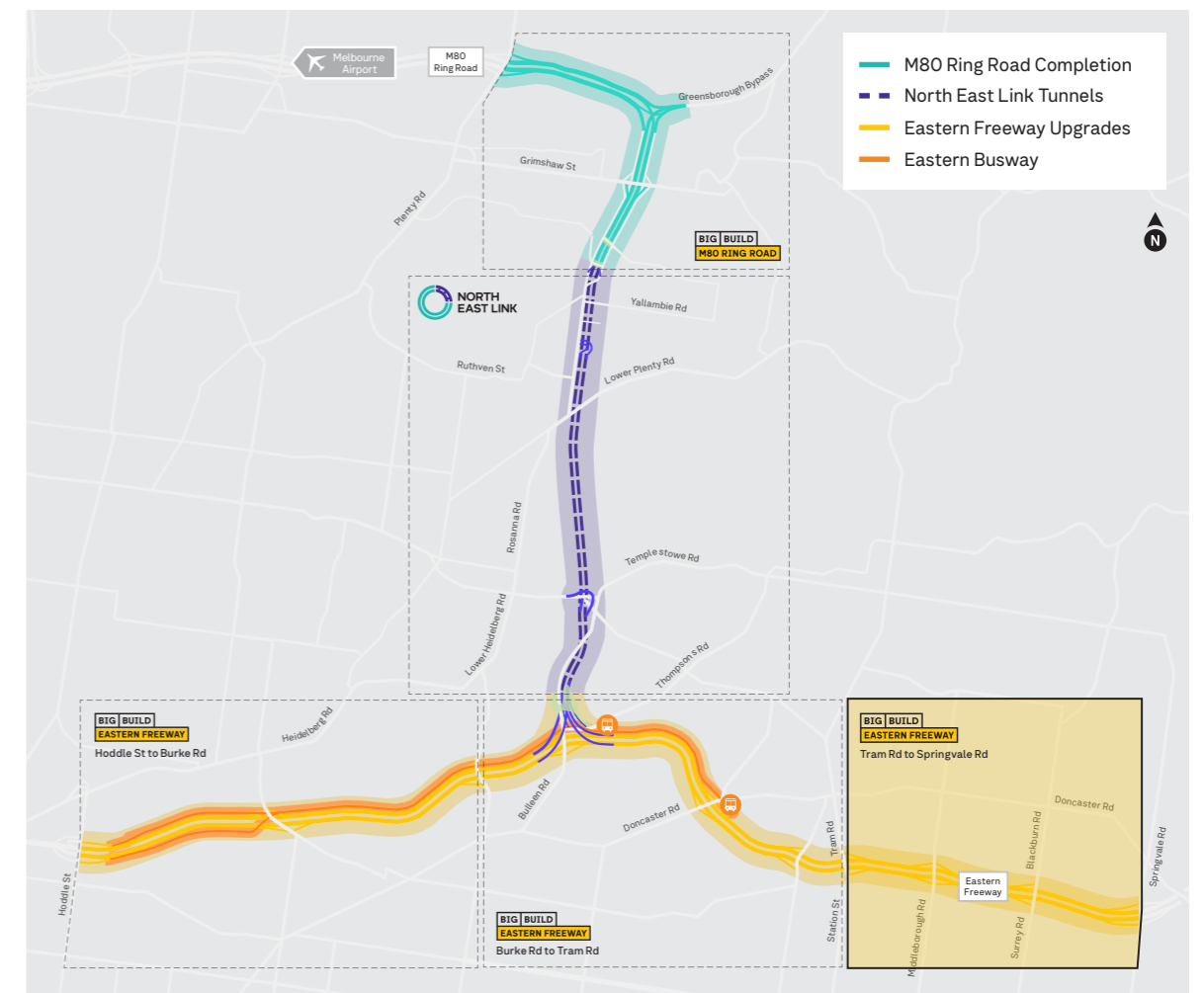
Figure 1: Eastern Freeway Upgrades – Tram Road to Springvale Road project area in relation to other North East Link projects

The siting of road infrastructure elements such as gantries and light poles are shown indicatively.