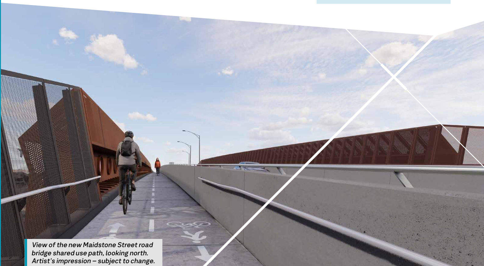
View of the new Maidstone Street road bridge shared use path, looking north. Artist's impression – subject to change.

Werribee Line level crossing free by 2030