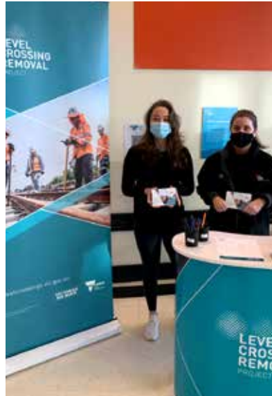
Members of the Ferguson Street project team at a pop-up stall outside Coles in Williamstown.

Keep an eye out for our project team in your local area.