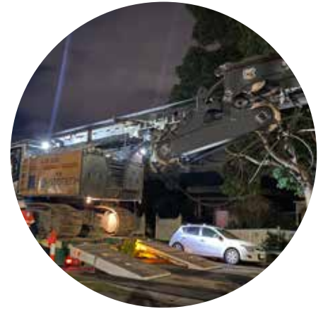
Piling rig arrives at Ferguson Street.

The machine spent about 100 hours, across 10 shifts, installing 34 underground concrete supports, up to 11 metres deep, for what will be the sides of the new rail trench. At peak construction, we expect to have five piling rigs being used to create the foundations for the new rail trench and station buildings.