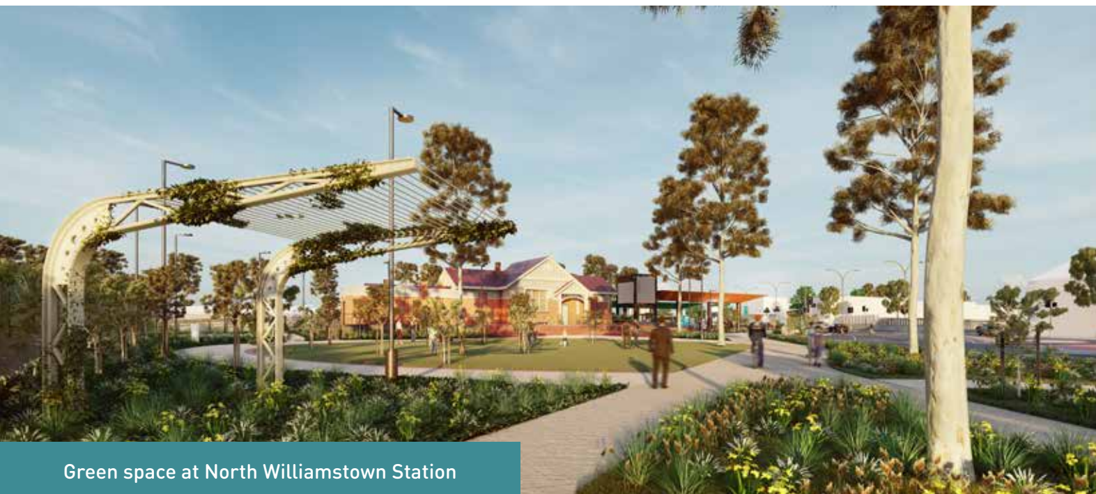
Green space at North Williamstown Station

Artist's impression only. Subject to change.