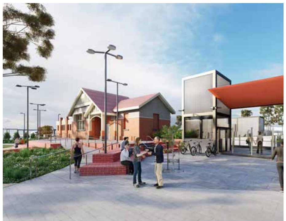
Artist impression of the new North Williamstown Station entry area.