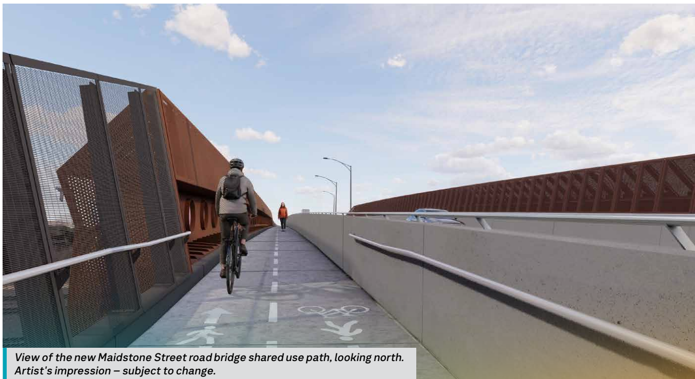
View of the new Maidstone Street road bridge shared use path, looking north. Artist's impression – subject to change.