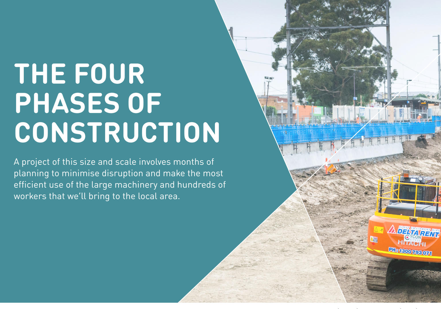
Rail trench works at Glenroy (above) and Ormond (right)