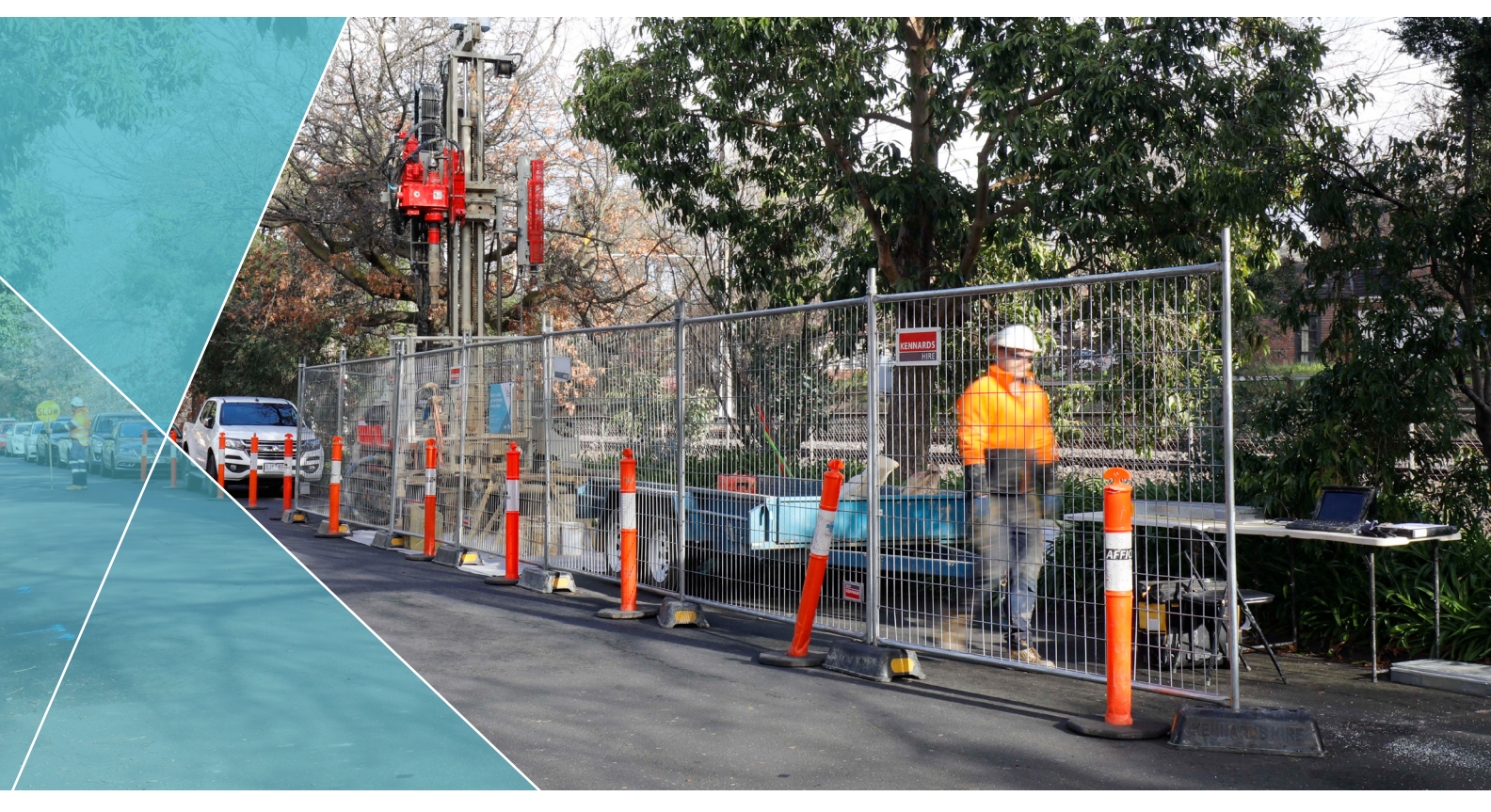
Early works will get underway soon