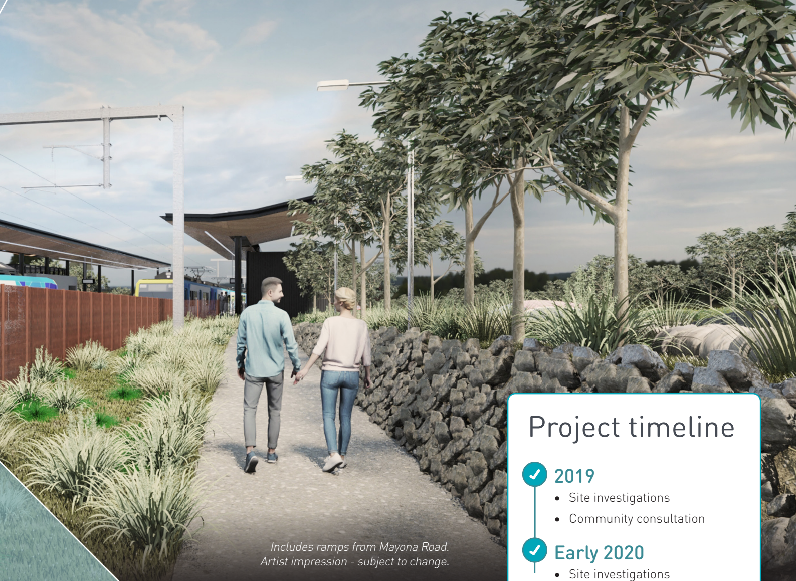
Includes ramps from Mayona Road. Artist impression - subject to change.