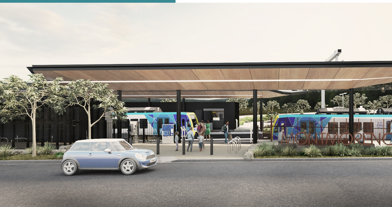
Station Road entrance to Montmorency Station. Artist impression - subject to change.