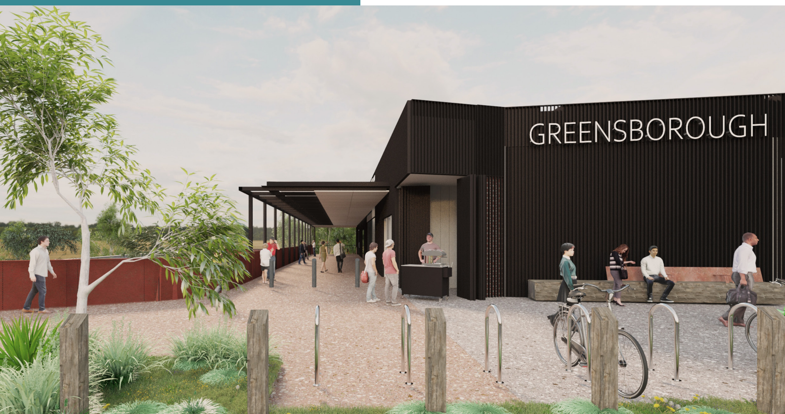
Para Road entrance to Greensborough Station. Artist impression - subject to change.