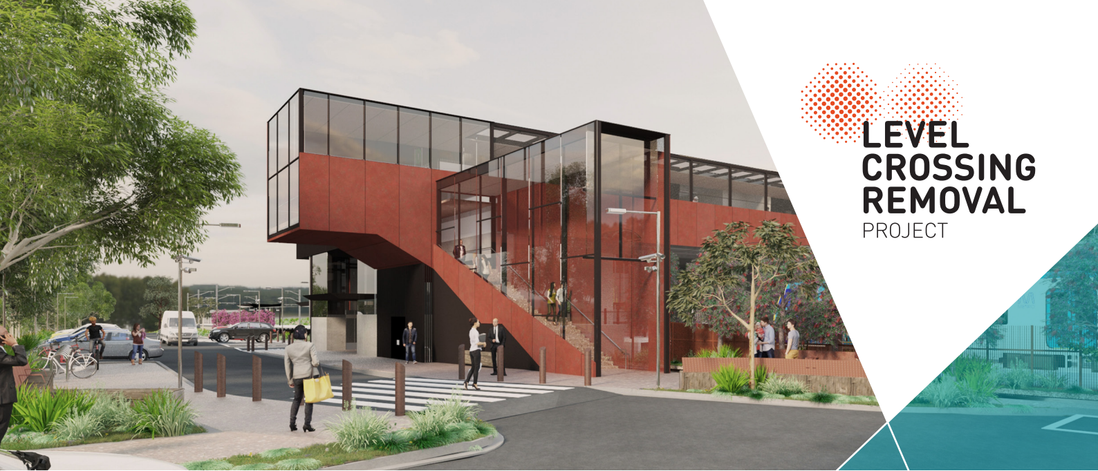
New Greensborough Station - Poulter Avenue entrance. Artist impression - subject to change.