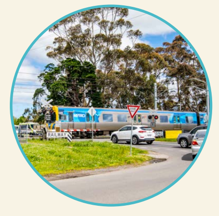
Level crossing at McGregor Road, Pakenham

Please note that the timeline above is subject to change.