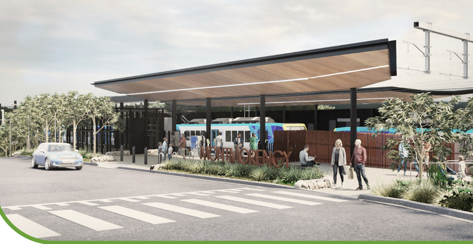
Montmorency Station. Artist's impression only - subject to change