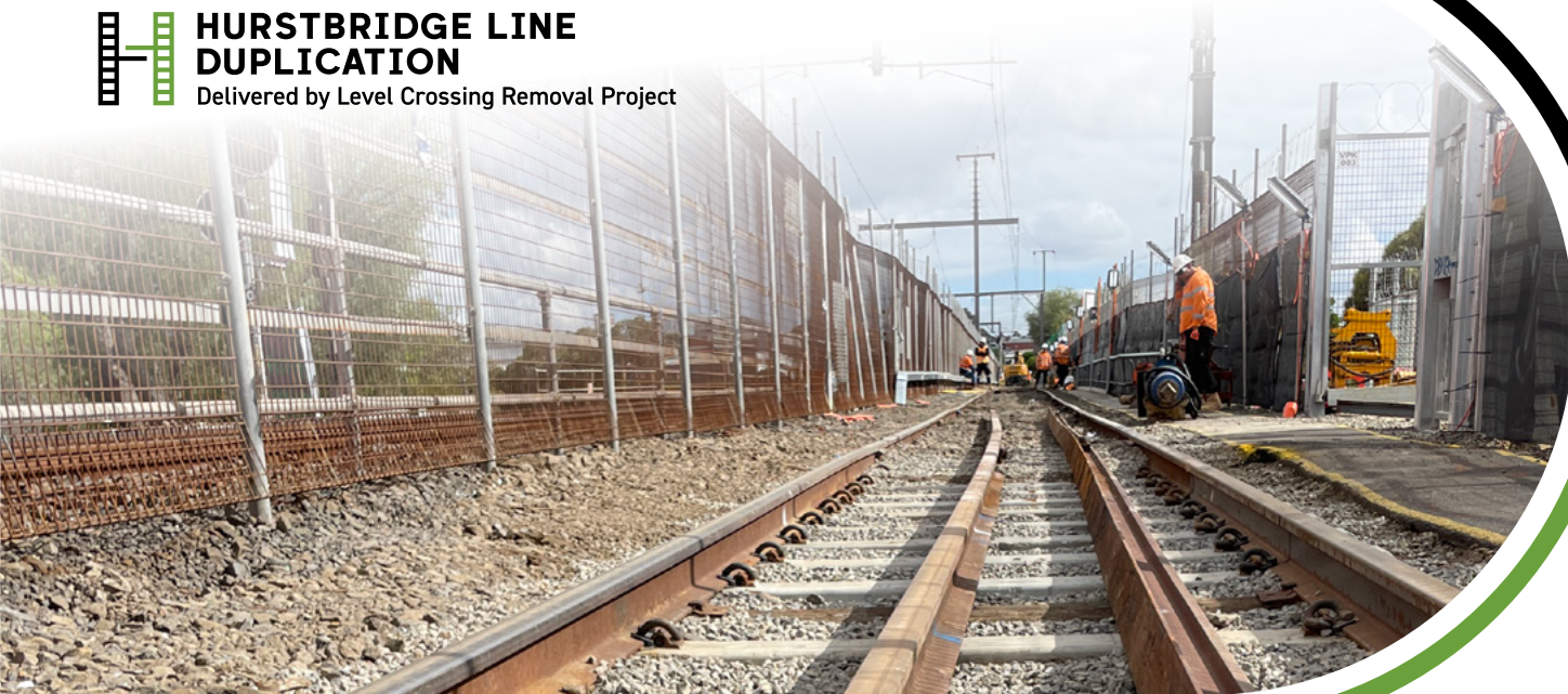
Rail tracks at Victoria Park Station