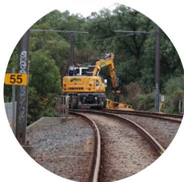
Digger in operation during March works

We thank you for your understanding and patience while we get on with the job of delivering one of the biggest investments in the Hurstbridge line in decades.