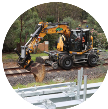
Crane in operation during March works