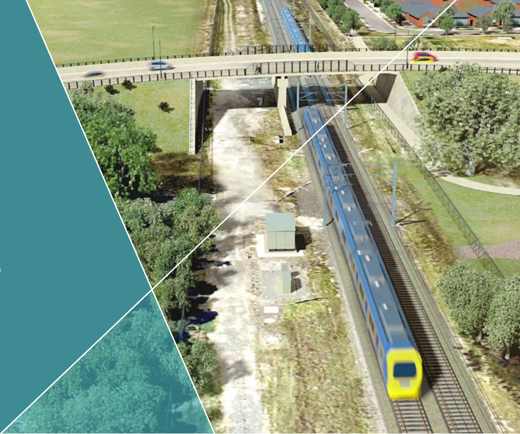
Artist impression only, subject to change

The Victorian Government is removing 22 dangerous and congested level crossings, including the one at Brunt Road, Beaconsfield as part of a $15 billion investment to upgrade the Pakenham Line that will improve safety, reduce congestion and allow more trains to run more often.