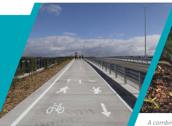
A combination of native trees, shrubs, flowering plants and grasses