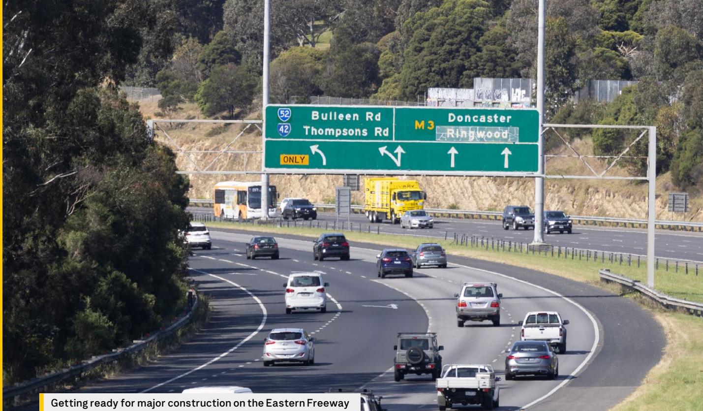
Getting ready for major construction on the Eastern Freeway