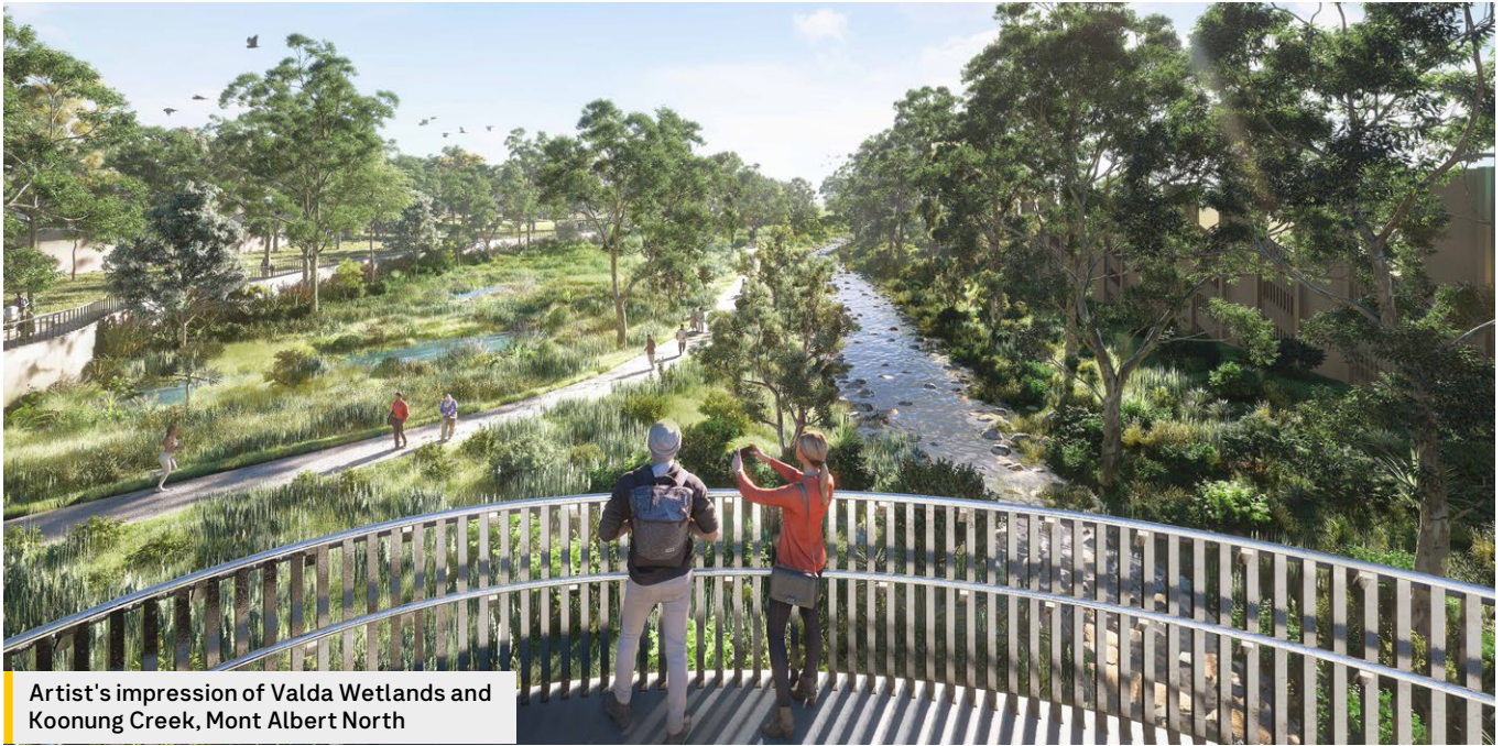
Artist's impression of Valda Wetlands and Koonung Creek, Mont Albert North