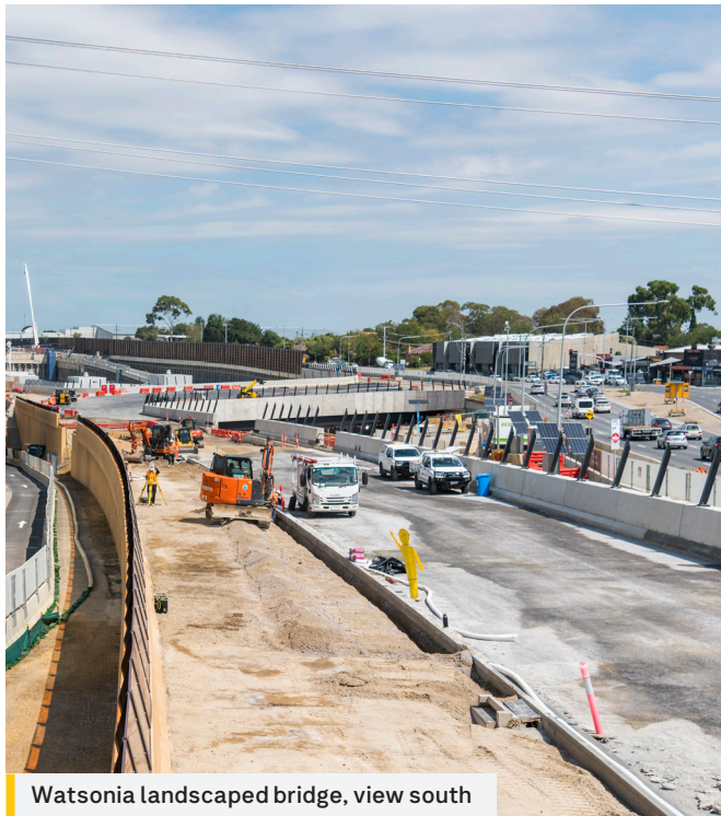
Watsonia landscaped bridge, view south