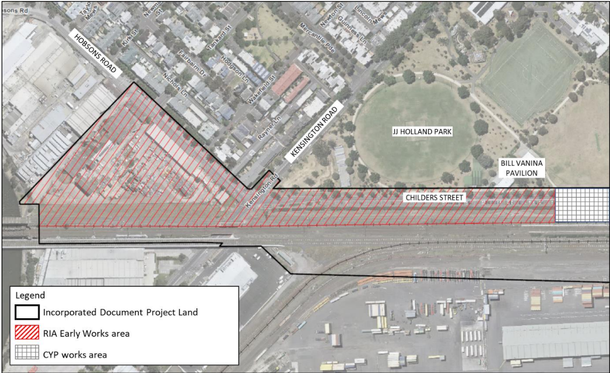
Figure 3 Western Portal RIA Early Works area (refer to Appendix C for details)

The Western Portal RIA Early Works area, identified as Precinct 2 in the Metro Tunnel EES, is located in Kensington. It is bound by JJ Holland Park to the north, the railway line and South Kensington station to the south, the CYP early works site to the east and the Maribyrnong River to the west. The works area is traversed by Childers Street and also affects part of Hobsons Road and Kensington Road.