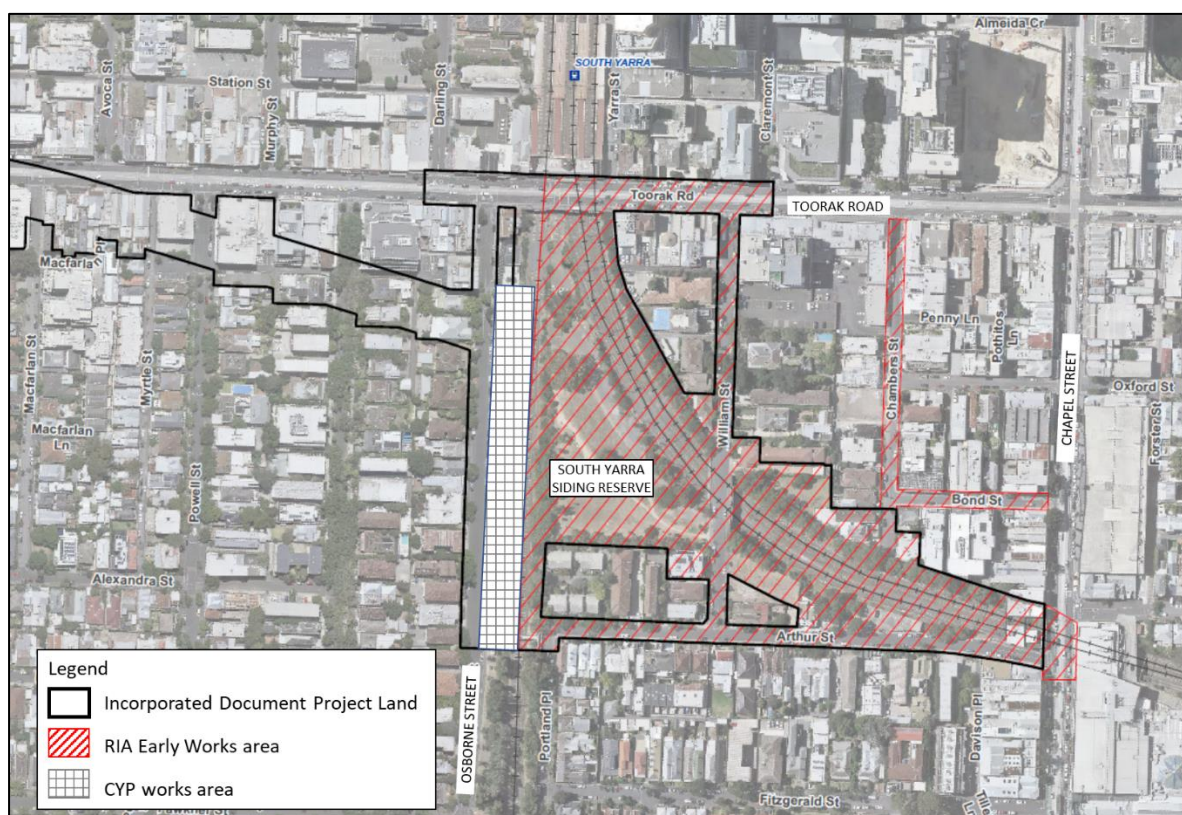
Figure 2 Eastern Portal RIA Early Works area (refer to Appendix A for details)

The Eastern Portal RIA Early Works area, identified as Precinct 8 in the Metro Tunnel EES, is located in South Yarra. It includes the South Yarra Siding Reserve, part of the Sandringham, Cranbourne and Pakenham rail corridors and part of local roads including Toorak Road, Osborne Street, Williams Street, Chambers Street, Arthur Street and Bond Street. The works area is bound by Toorak Road to the north, Chapel Street to the east, Arthur Street to the south and Osborne Street to the west. South Yarra station is located immediately north of the precinct.