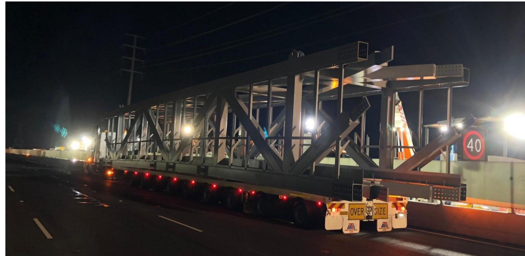
Muir Street trusses arrive on site at West Gate Freeway