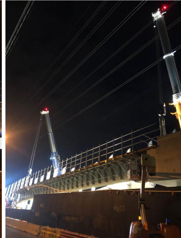
The new overpass ramp sections being lifted into position