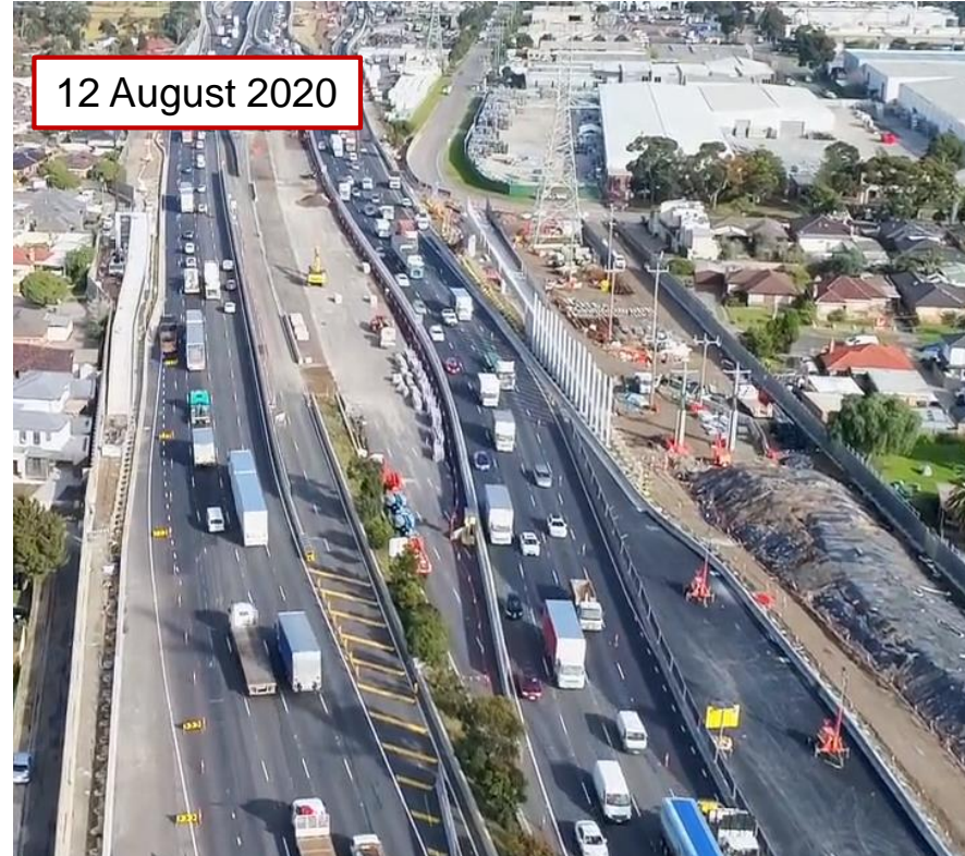
West Gate Freeway both directions between Grieve Parade and Millers Road