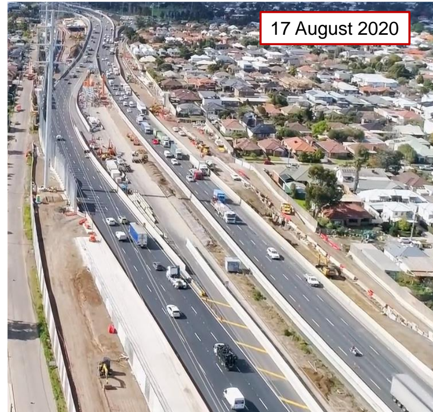
West Gate Freeway both directions between Millers Road and Williamstown Road