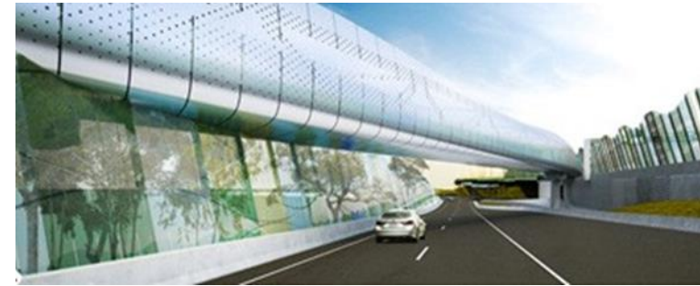
Artistic view of SUP over the Williamstown Road inbound exit ramp