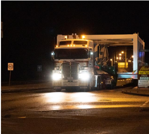
Muir Street trusses transported to site