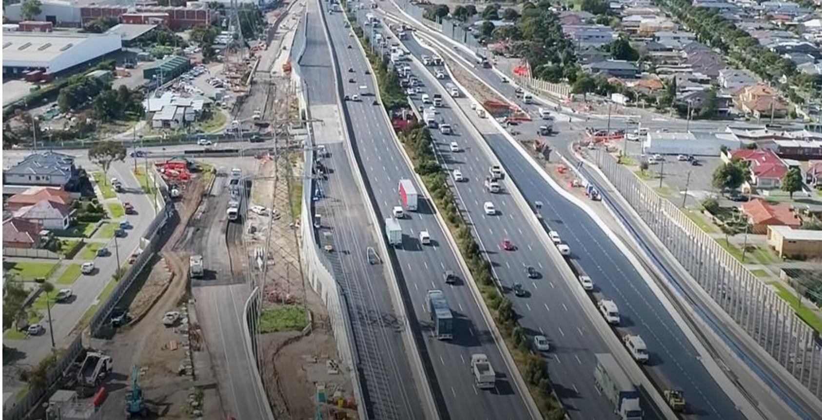
Millers Road interchange works