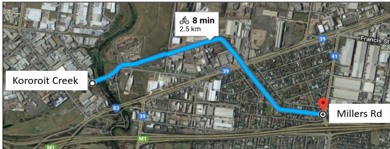
Federation Trail section to be resurfaced