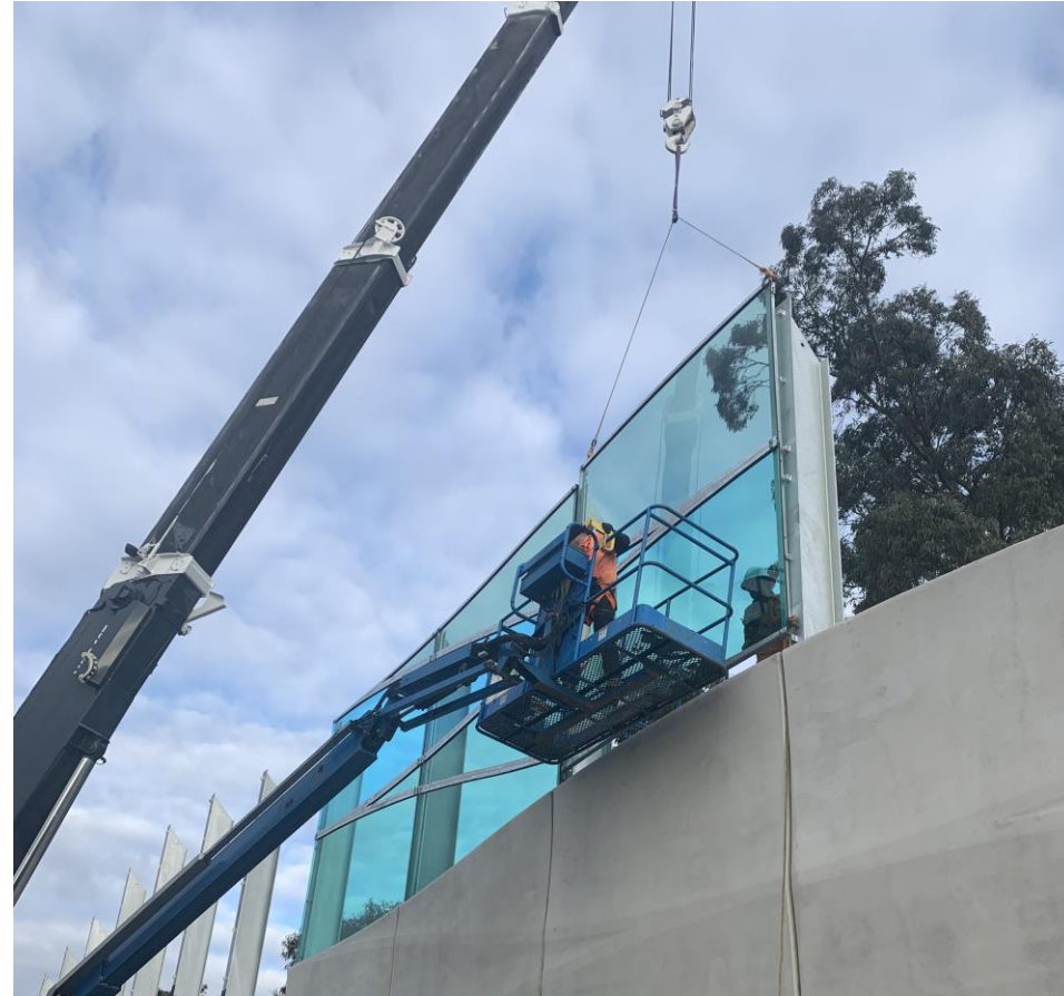
New noise walls including acrylics panels being installed