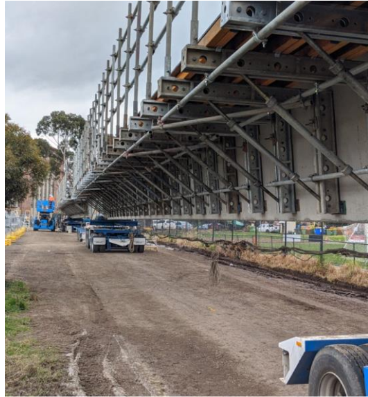
Overpass ramp sections stored at the Footscray Hockey Club