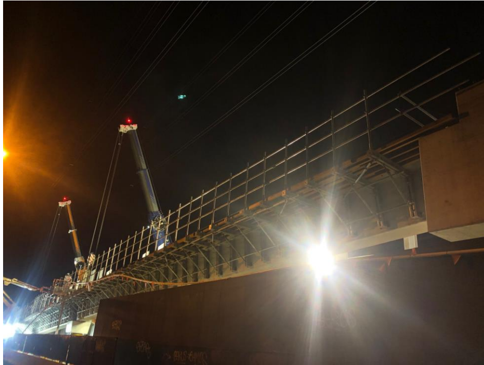
The new overpass ramp sections being lifted into position