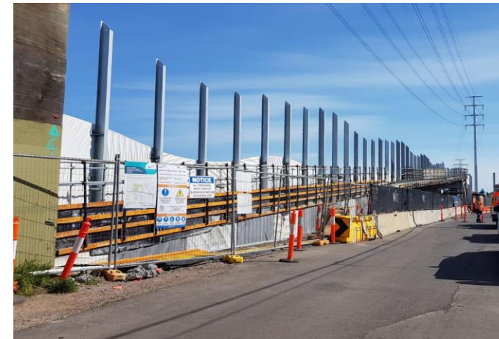
The installed ramps by day