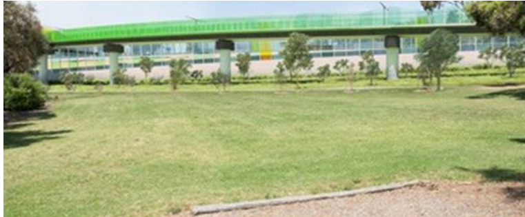
Artistic view of SUP from the reserve at the end of Fogarty Avenue