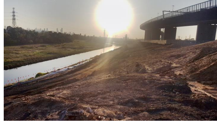
Stony Creek earthworks in preparation for temporary access track