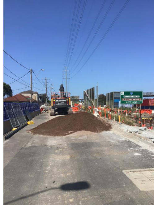
Preparing for trenching