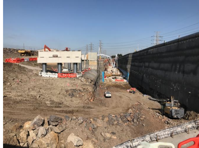
Cut and cover works at TBM retrieval pit