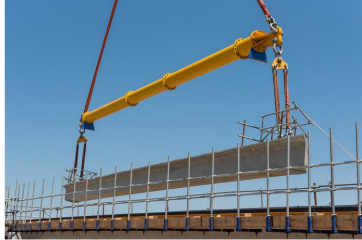
Top-down bridge beam lift