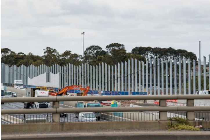
Noise walls being installed along the West Gate freeway