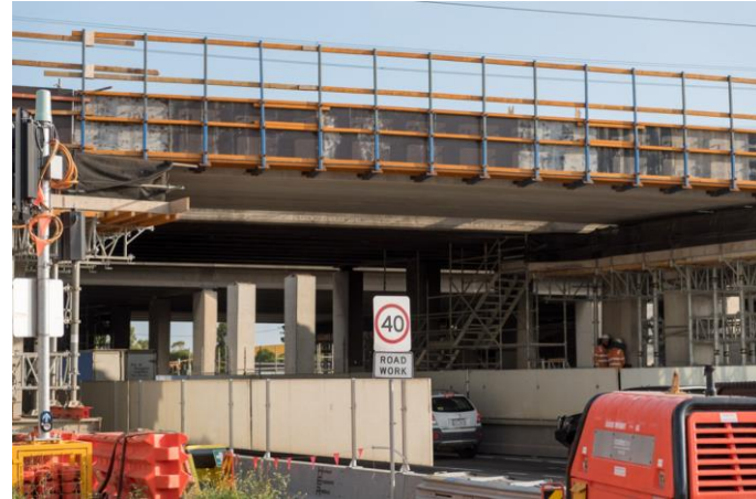
Millers Road bridge works