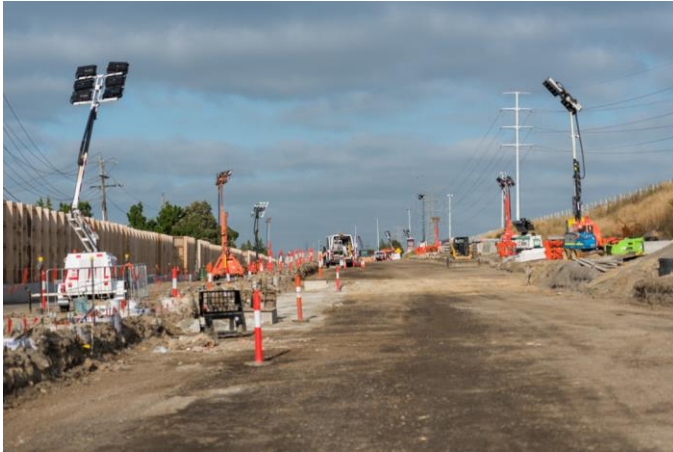
Millers Road outbound entry ramp