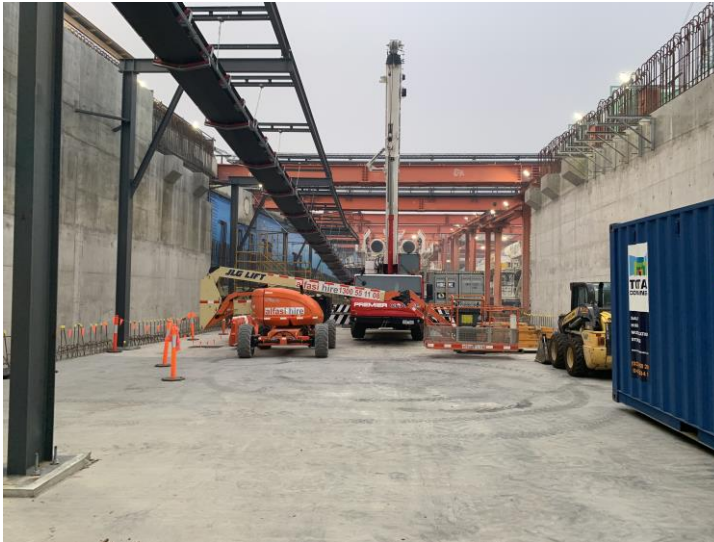
Wall and corbel construction