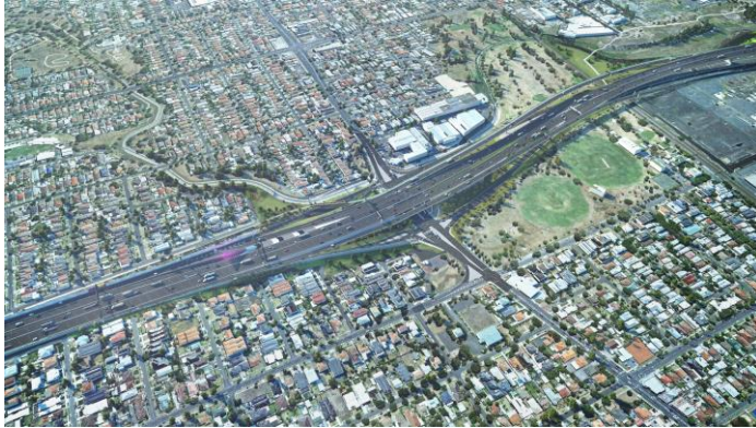
Arial view of Hyde Street Ramps