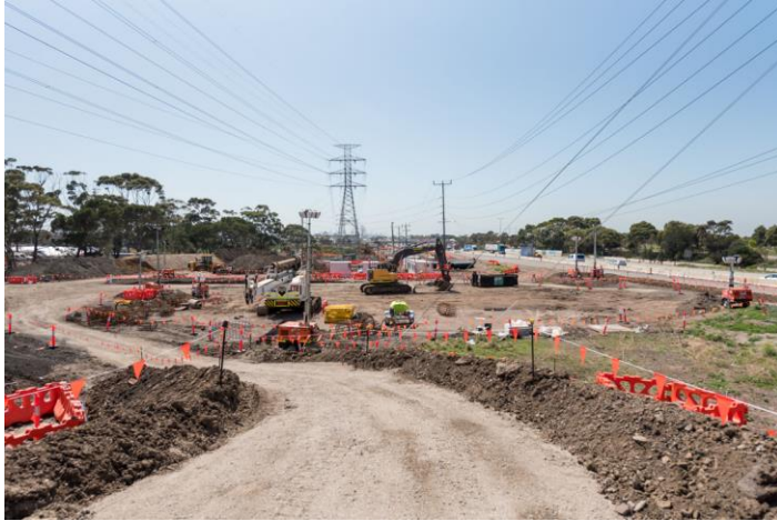
Preparatory works for M80 ramps