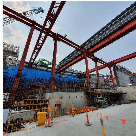
Maintenance level road deck