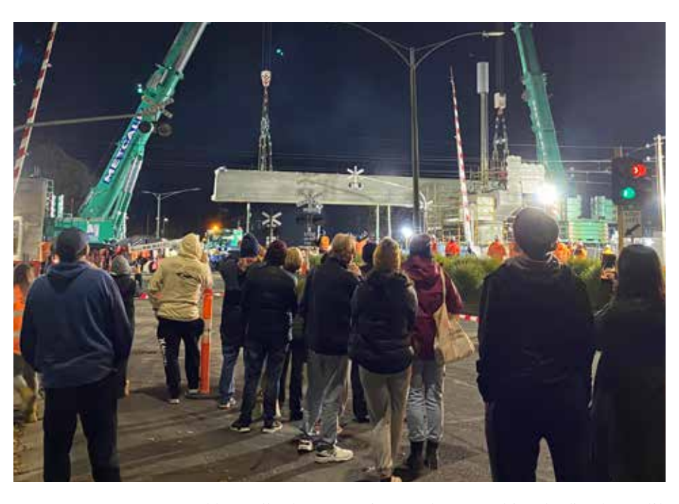
Mooroolbark community members watching the first beam lift

Locals will continue to see L-beams delivered through the year until the bridge is built in October.