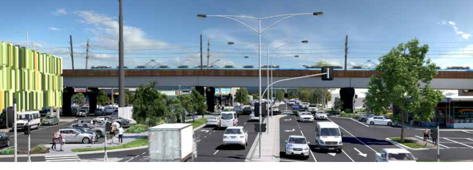
Looking south on Manchester Road. Artist's impression only, subject to change.