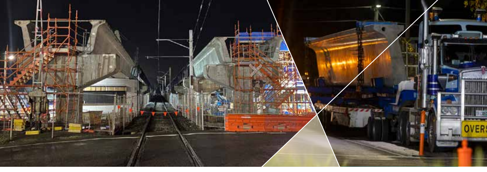
The new bridge viaducts taking shape at Lilydale