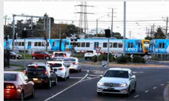
Warrigal Road, Mentone