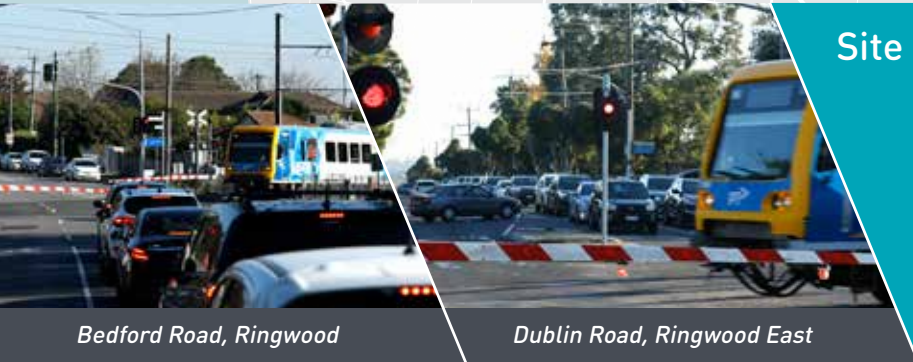
Bedford Road, Ringwood