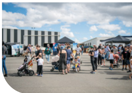
The Mobile Info Hub at Footscray's Lunar New Year Festival