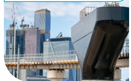
Cross head install