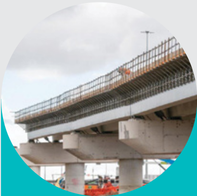
City bound Hyde Street ramp construction underway

Construction of the Hyde Street ramps continues throughout 2022.