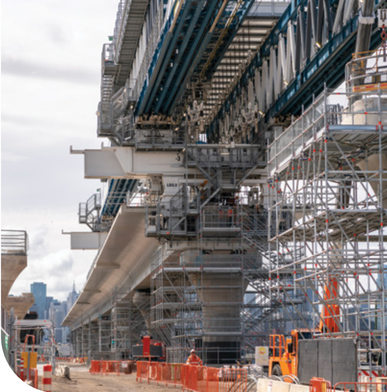
Photo of spans constructed to date

Scan to the QR code to see how the launching gantry builds the elevated road.