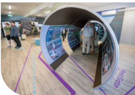
Open Day at the Info Centre in Yarraville

For up to date information on where the Mobile Info Hub will be next, visit bigbuild.vic.gov.au and check out our socials.