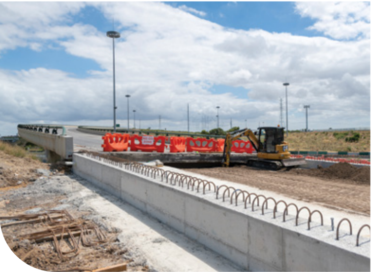
Construction of a new ramp at the M80 during summer works