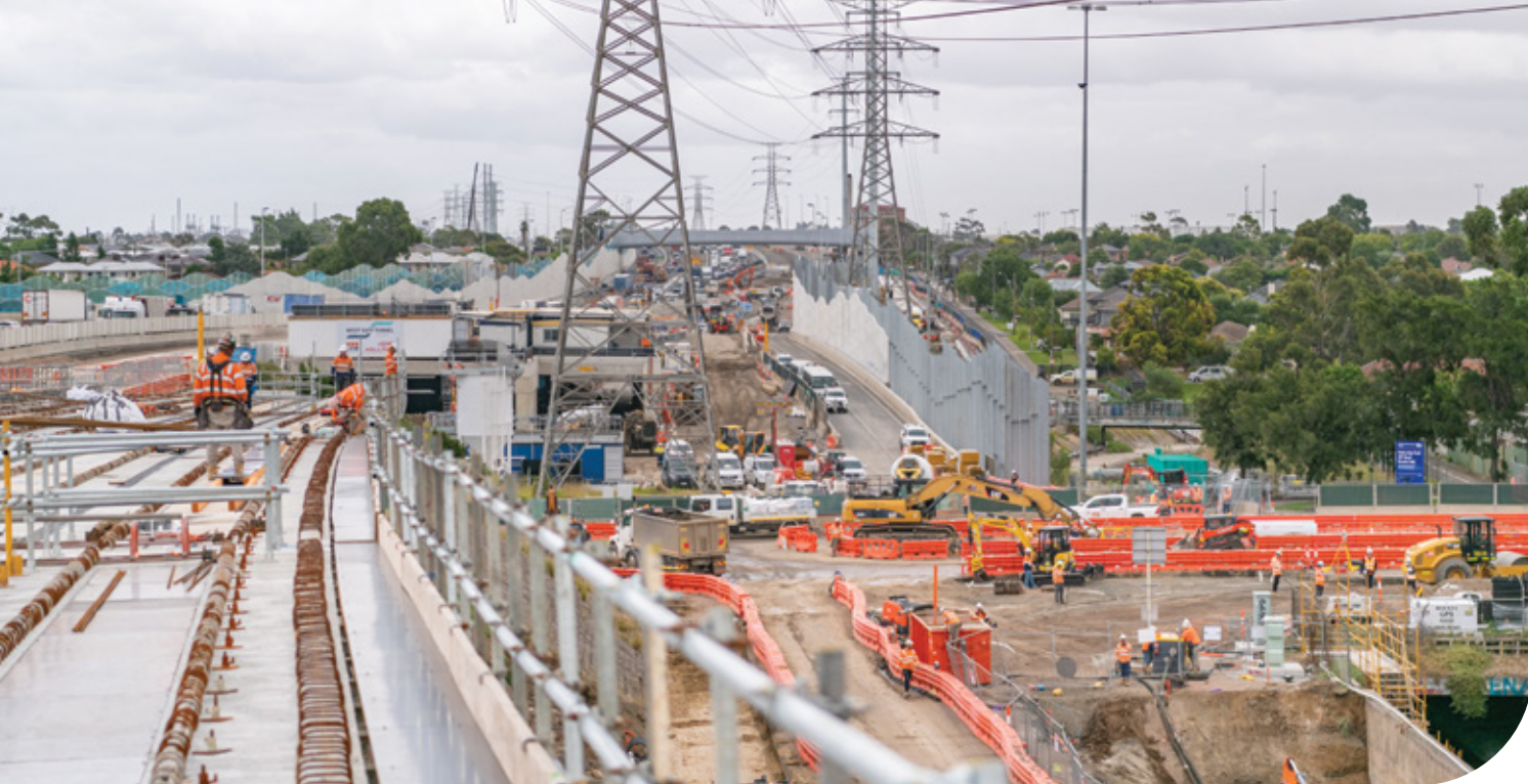
Construction activity at Williamstown Road during summer campaign works