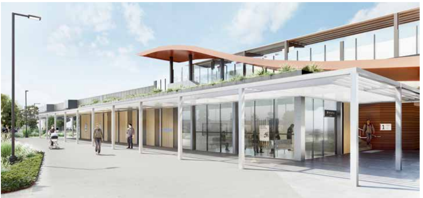
Air-conditioned waiting room with rooftop garden and elevated station platform – artists impression, subject to change