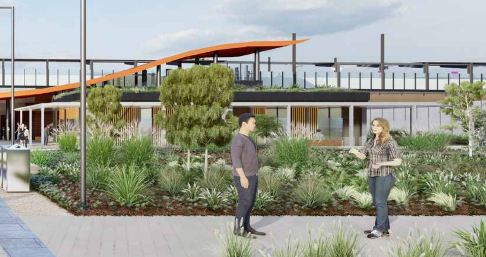
Bunjil the Great Creator Spirit spreads his protective wings over the community on Wurundjeri Woi-wurrung Country – artists impression, subject to change