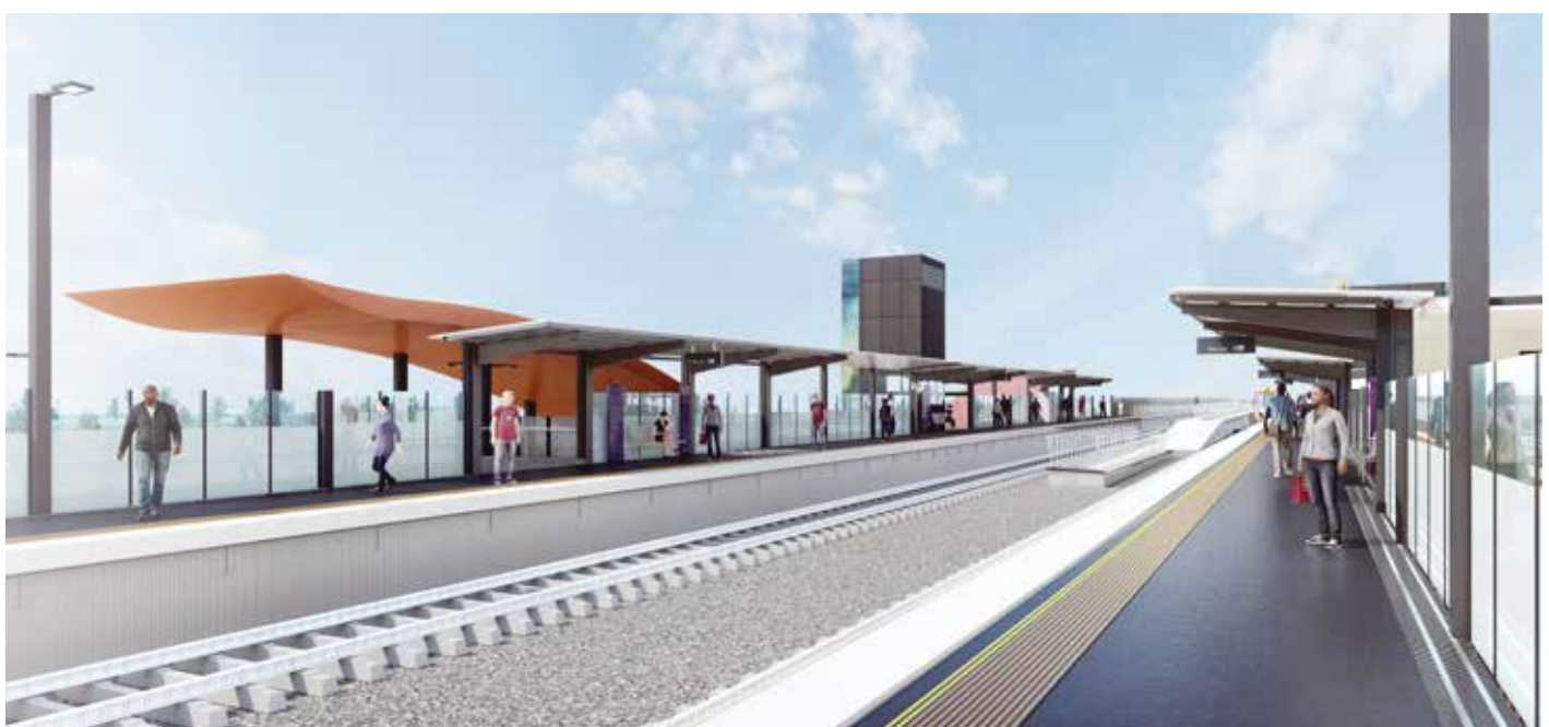
Deer Park Station elevated platforms – artists impression, subject to change

150 new and upgraded car parks as part of the Car Parks for Commuters program