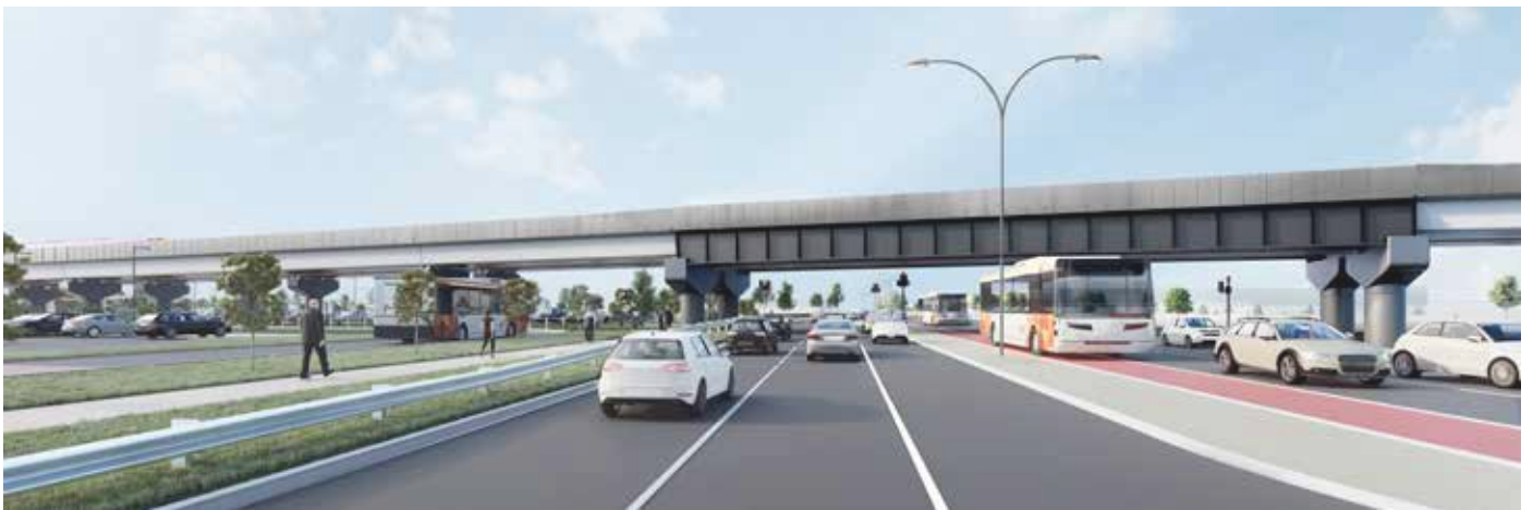
The new rail bridge that will take trains over Mt Derrimut Road – artists impression, subject to change