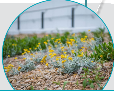
Landscaping in the station precinct