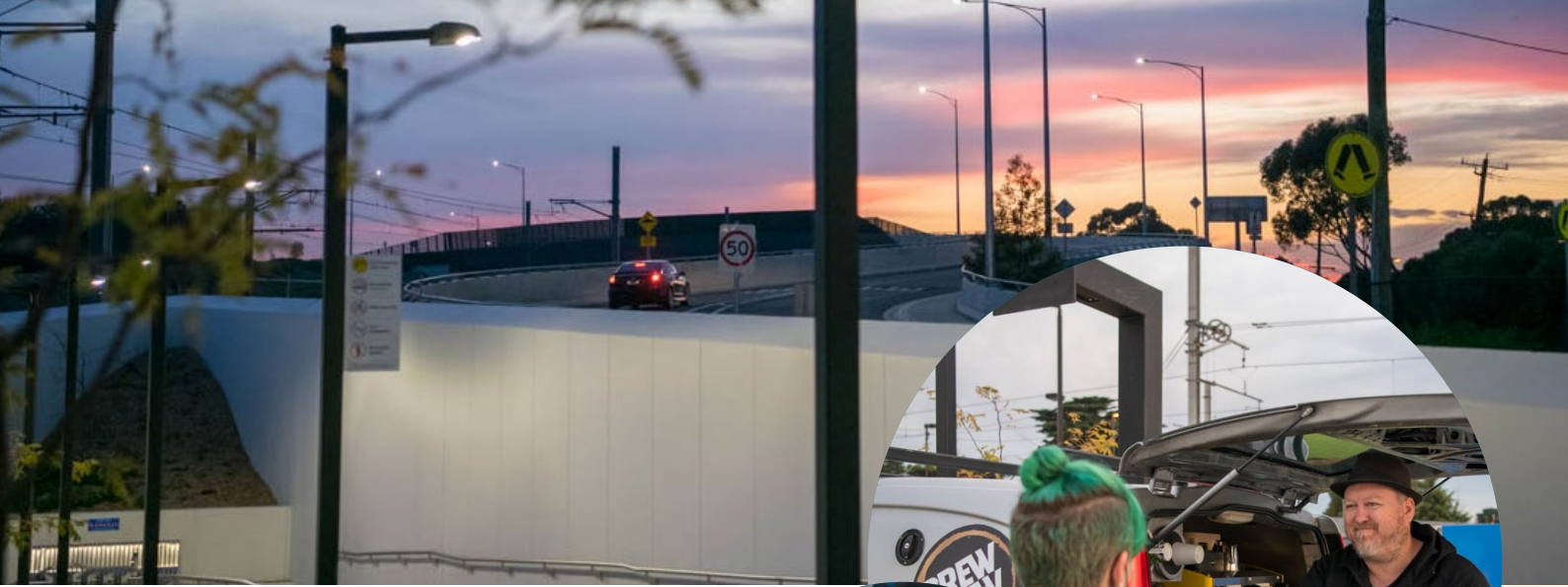
View of the road bridge from the Aircraft Station precinct.