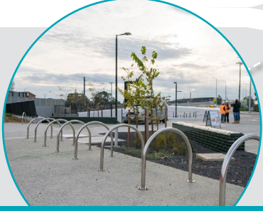
New and upgraded bike storage facilities