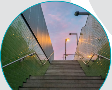
The new pedestrian and cyclist underpass connects Maher Road and Aviation Road to Aircraft Station