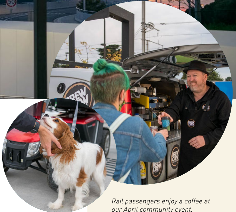
Rail passengers enjoy a coffee at our April community event.