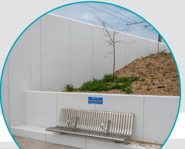
Seating in the new landscaped forecourts