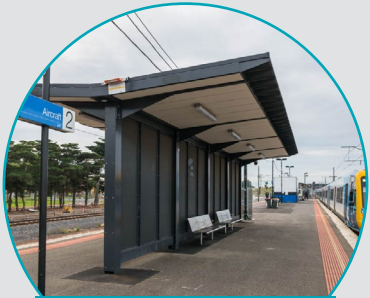
New station platform