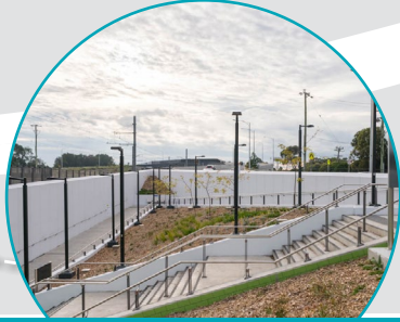
Ramps and stairs in the new landscaped forecourts connect pedestrians and cyclists to the station platforms