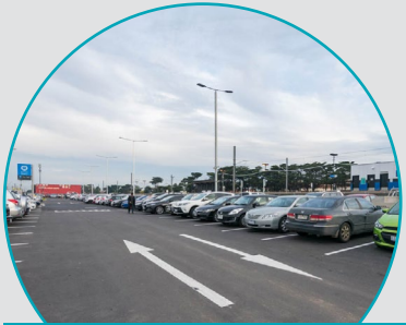
100 new and upgraded car parking spaces