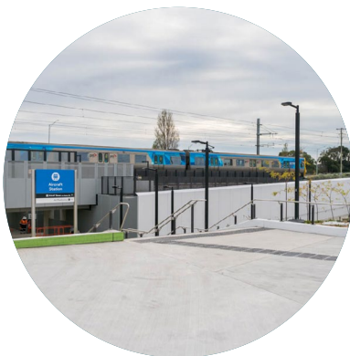
New landscaped forecourt leading to the pedestrian and cyclist underpass

Major works have now begun at Mt Derrimut Road in Deer Park, where we are removing the level crossing by raising the rail line over the road. We'll also build a new Deer Park Station.