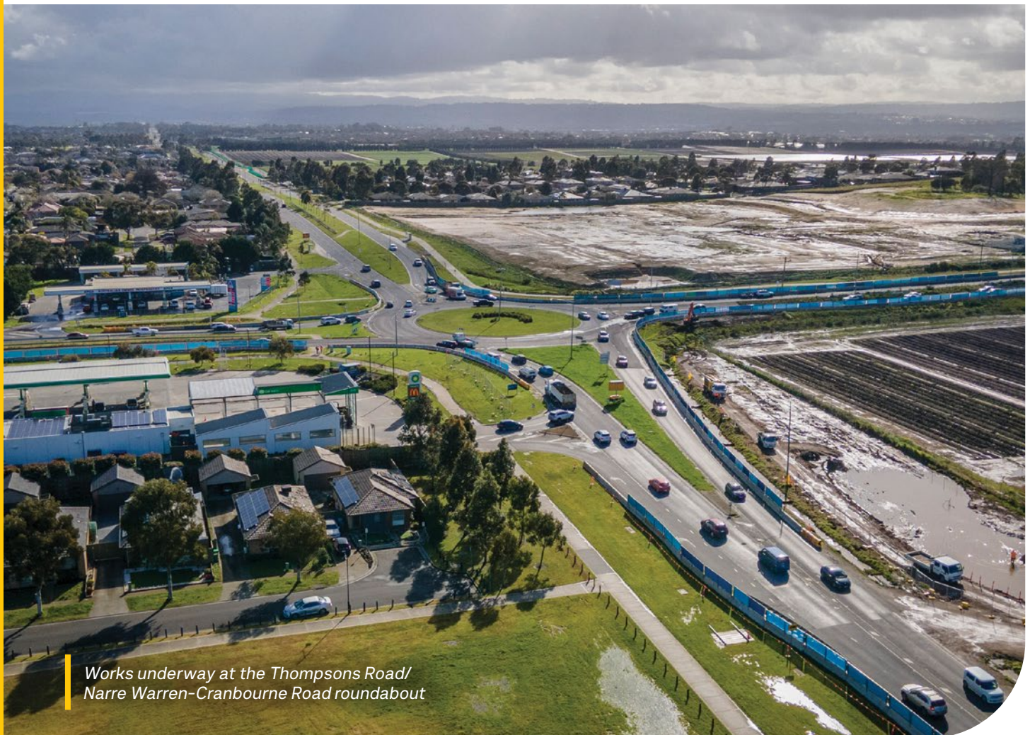
Works underway at the Thompsons Road/ Narre Warren-Cranbourne Road roundabout