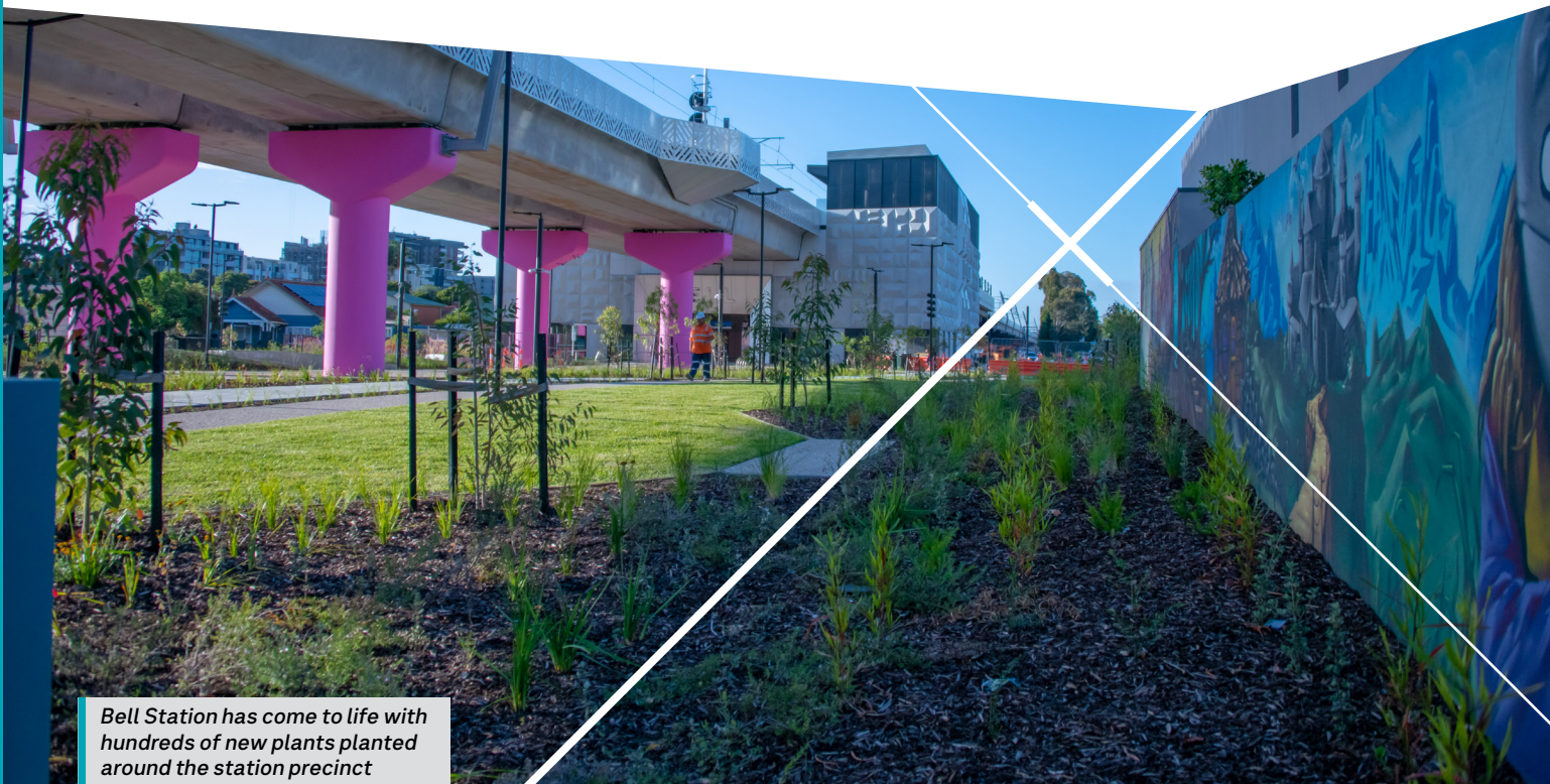
Bell Station has come to life with hundreds of new plants planted around the station precinct