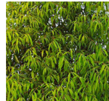
Weeping lilly pilly