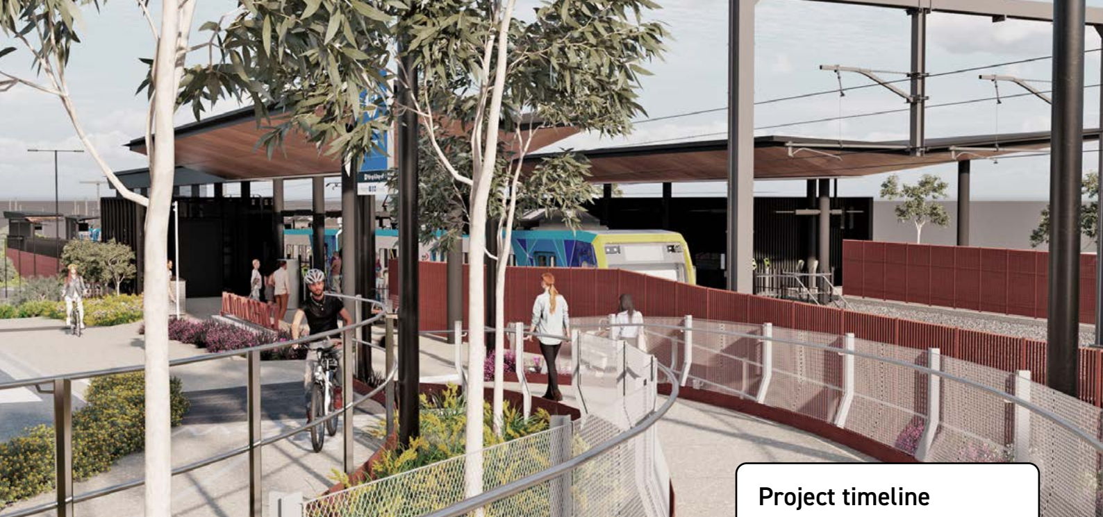
Cyclist riding on the new shared use path at the new Montmorency Station. Artist impression only – subject to change.