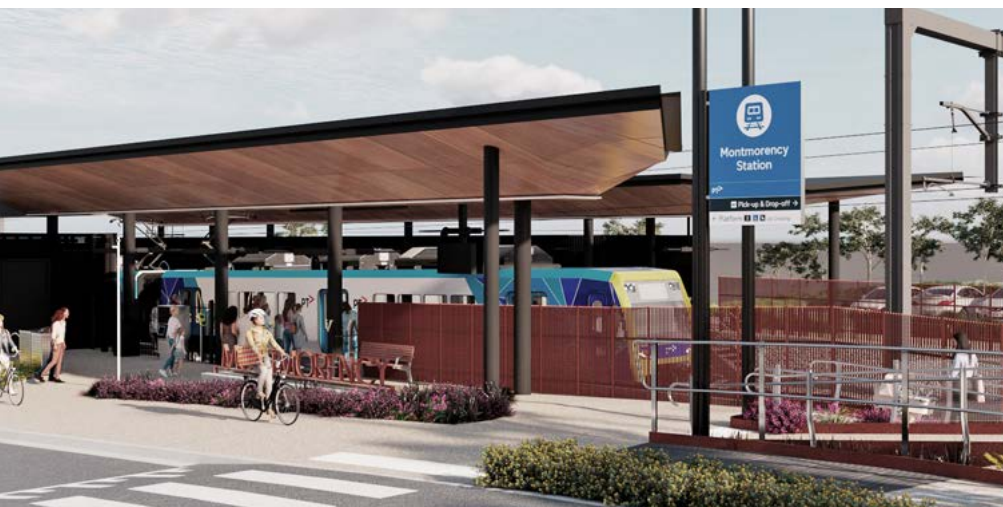
New Montmorency Station entrance – view from Were Street and Binns Street. Artist impression only – subject to change

The upgraded rail crossings provide safe connections to the new shared path further improving access to public transport, residential areas and local shops.