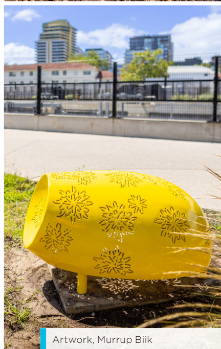
Artwork, Murrup Biik