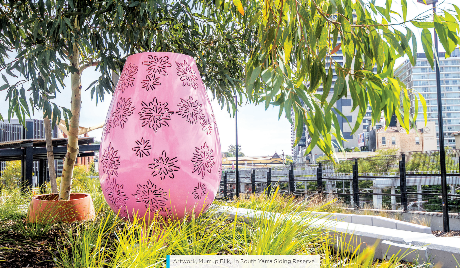
Artwork, Murrup Biik, in South Yarra Siding Reserve