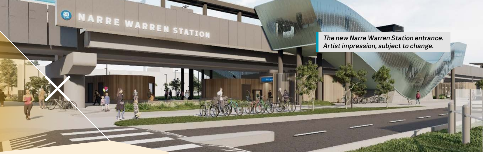
The new Narre Warren Station entrance. Artist impression, subject to change.