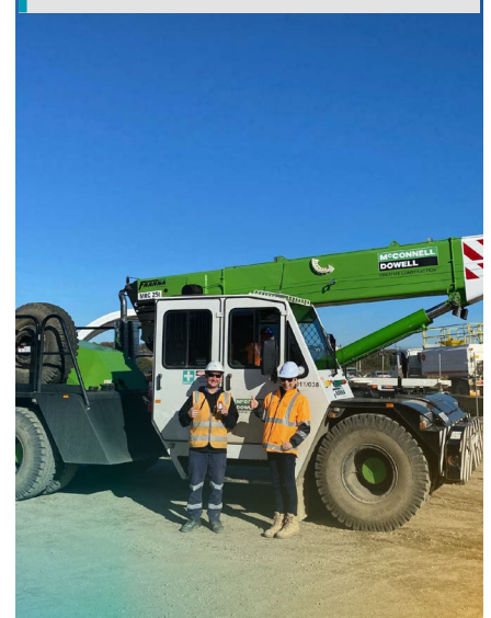
The low-carbon crane at Webb Street

This diesel alternative can reduce emissions by up to ninety percent. Data from the trial will go towards understanding and promoting renewable fuel options in construction.