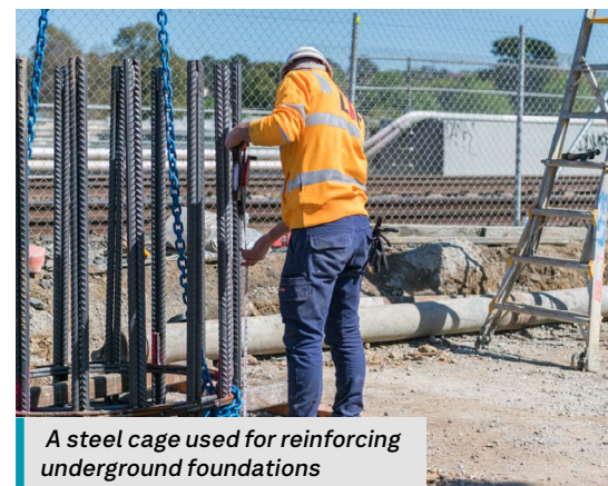
A steel cage used for reinforcing underground foundations