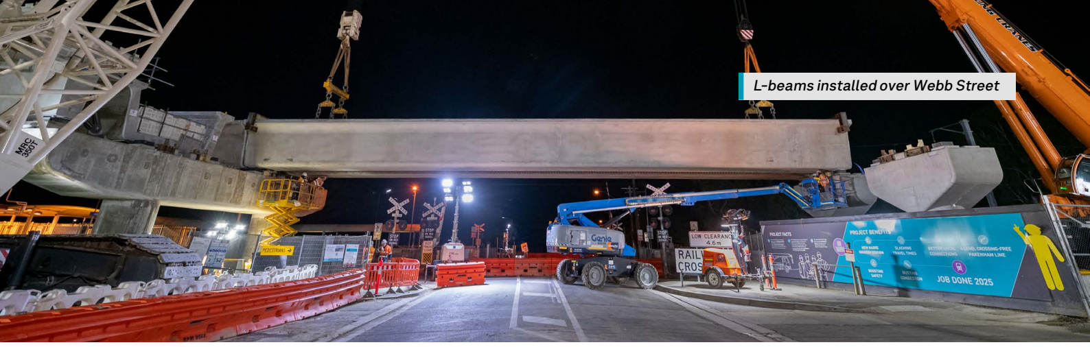
L-beams installed over Webb Street