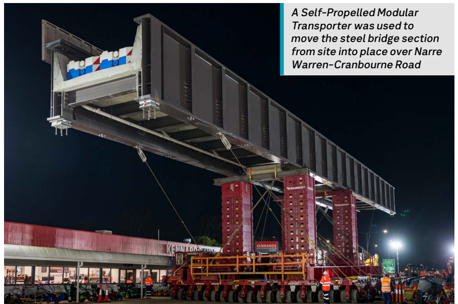
A Self-Propelled Modular Transporter was used to move the steel bridge section from site into place over Narre Warren-Cranbourne Road

So we can safely build the new Narre Warren Station, trains will run express through Narre Warren Station over the new rail bridge. Narre Warren Station will remain closed until late March 2024. A shuttle bus service will transport passengers between Narre Warren Station and Hallam and Berwick stations during this time. For more information, please visit ptv.vic.gov.au/cranpak