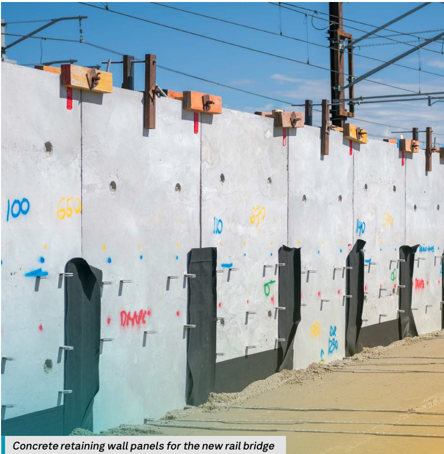
Concrete retaining wall panels for the new rail bridge

Visit our website for more information about how we're building the rail bridge – levelcrossings.vic.gov.au/nw-building-the-rail-bridge